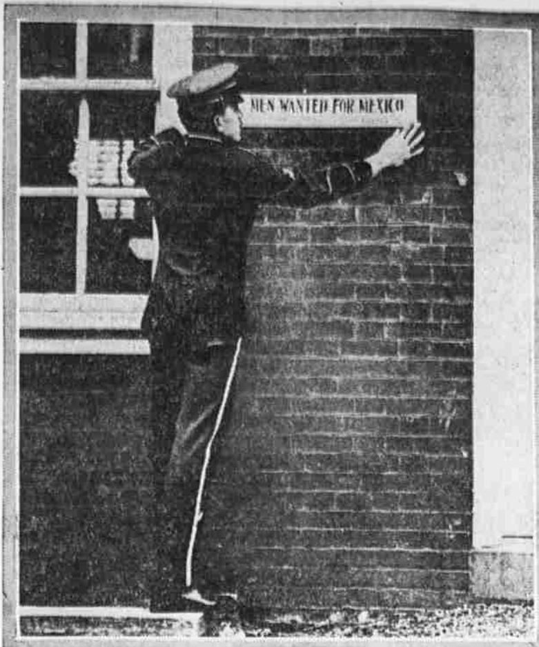
Five thousand posters, with the inscription in large red letters reading "Men Wanted in Mexico," were placed at prominent points all over the central part of the city today by the Central Army Recruiting Office, 1229 Arch street. The appeal, according to Capt. A. A. King, of the recruiting office, is meeting with excellent results.