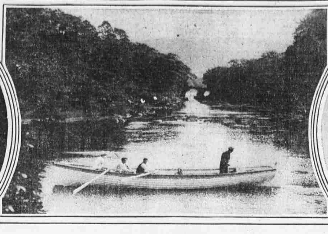
THE LAKES OF KILLARNEY Most beautiful spot in all Ireland, according to eminent authorities.