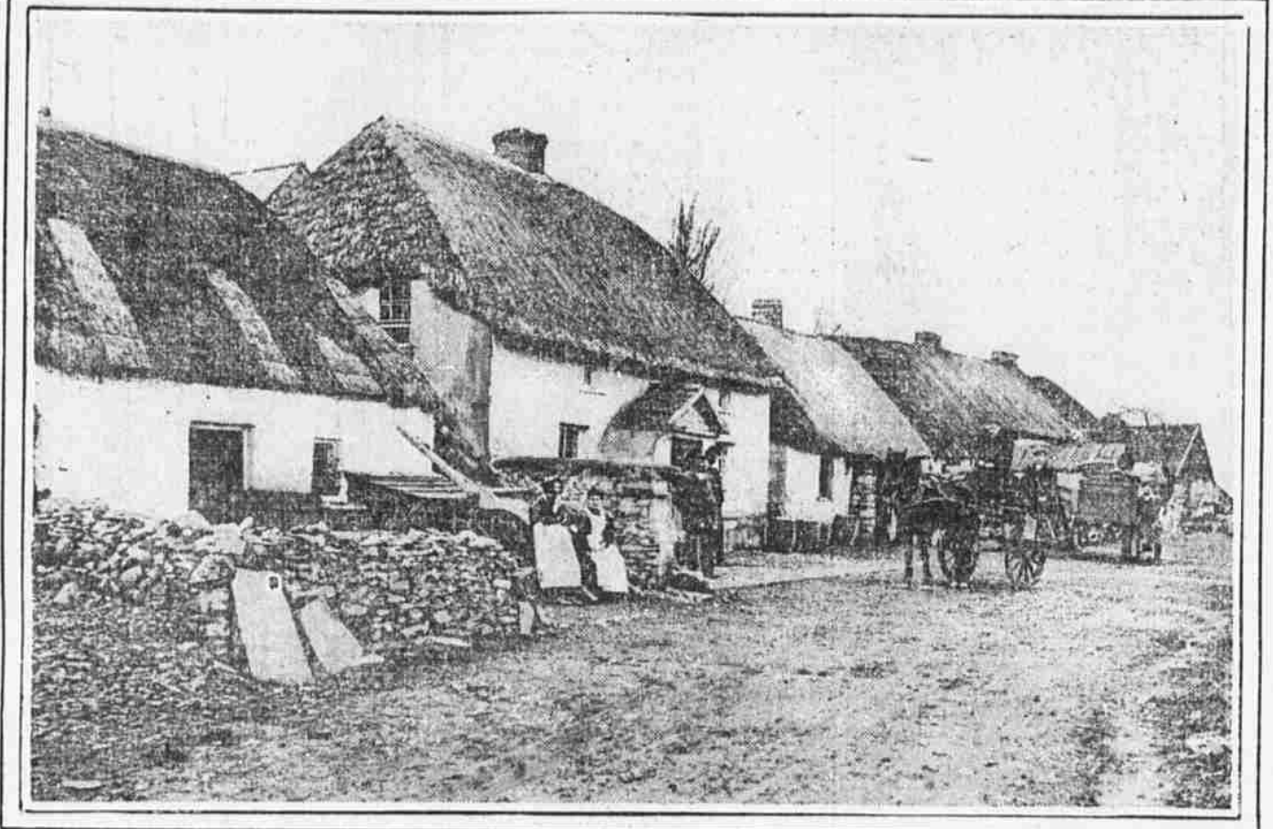
A BIT OF IRELAND THAT THE POETS LOVE Tara village, in County Meath