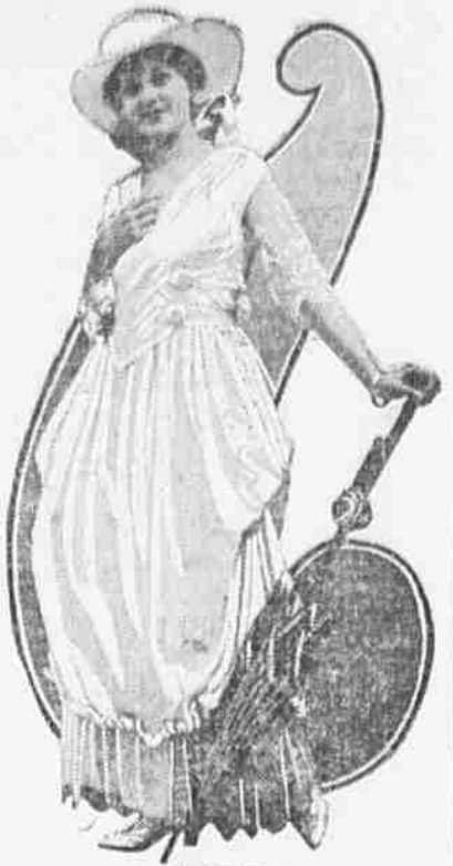
"MISS X." Who caused strike of girl models for the Fashion Show. She declined to give any other name.

Stately Brunette, Singled Out for Special Distinction by Inspector, Stirrs Wrath of Her Fair Sisters