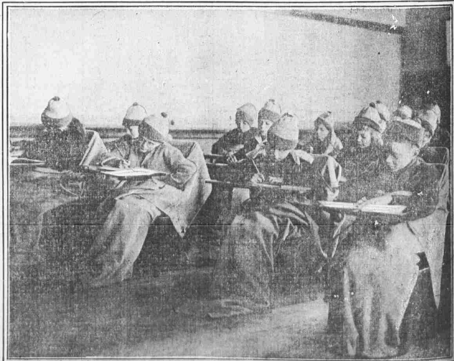
OPEN AIR CLASS OF SCHOOL CHILDREN LOOK LIKE YOUNG ESKIMOS Outdoor study at the Bache School, 22d and Brown streets, has been prosecuted with much success and it is probable that the idea will spread rapidly—a contrast to the times of our fathers when cold, fresh air in a schoolroom was looked upon as dangerous.