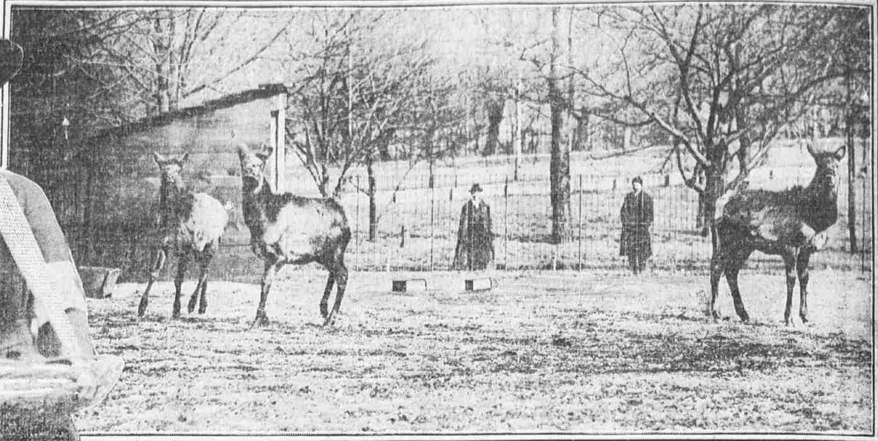
THREE YOUNG ELK ARE LATEST ZOO ADDITIONS These youngsters were captured only a few weeks ago in the Yellowstone National Park for the State Game Commission.