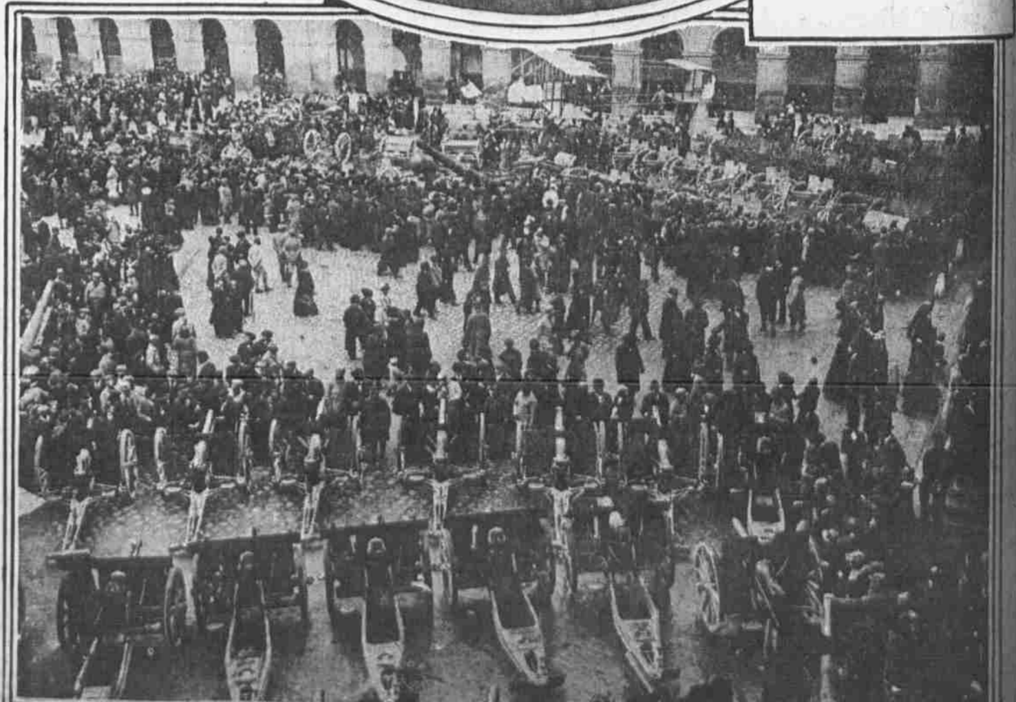
PARIS VIEWS NEW GUNS AND WARPLANES TAKEN FROM THE GERMANS

A French colonel of dragoons is shown at the right pinning the medals on the "pouus" at a review held not far behind the battle line.