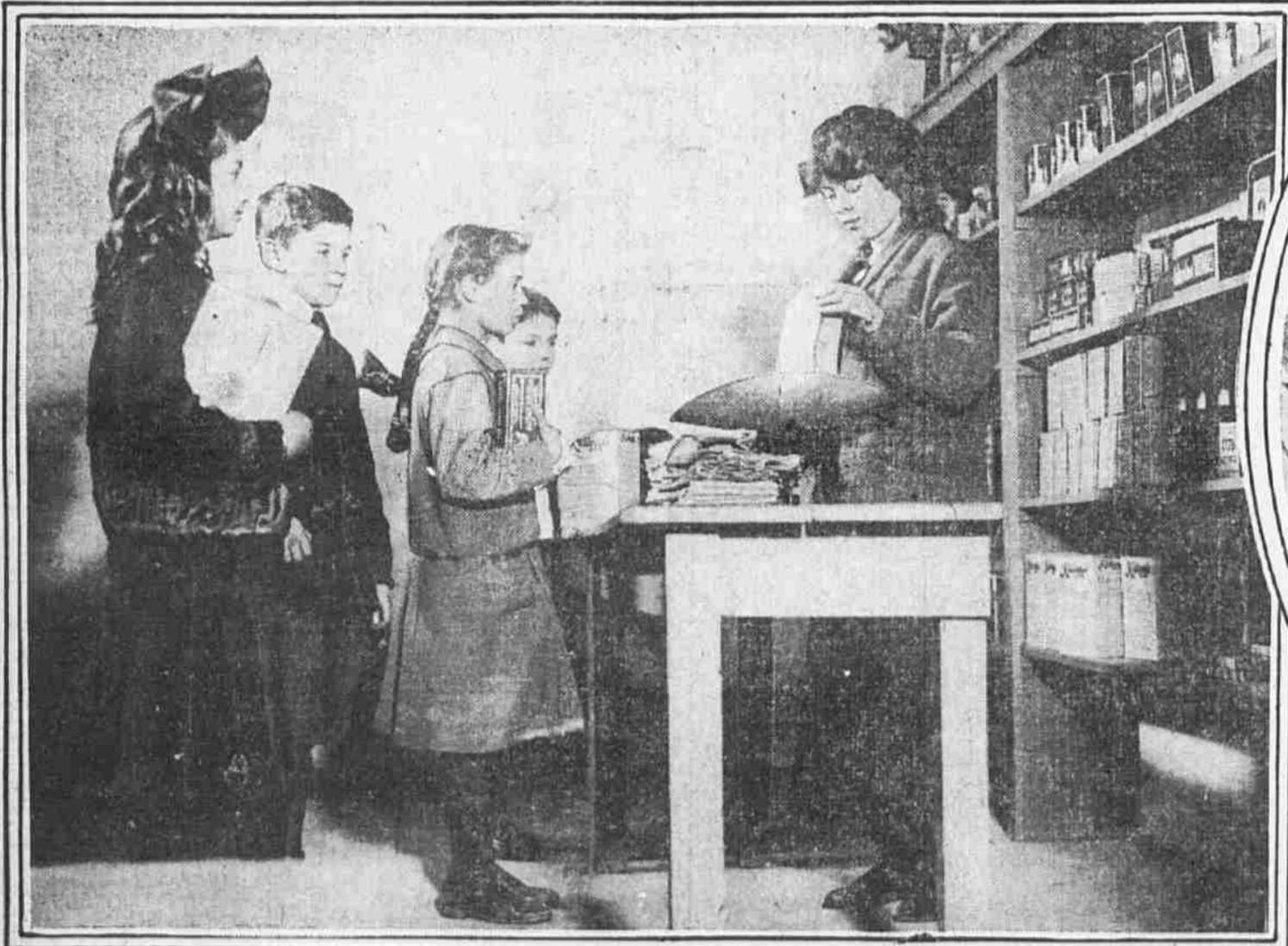
"MODEL STORE" TEACHES PUPILS PRACTICAL LESSONS IN BUSINESS DEALINGS