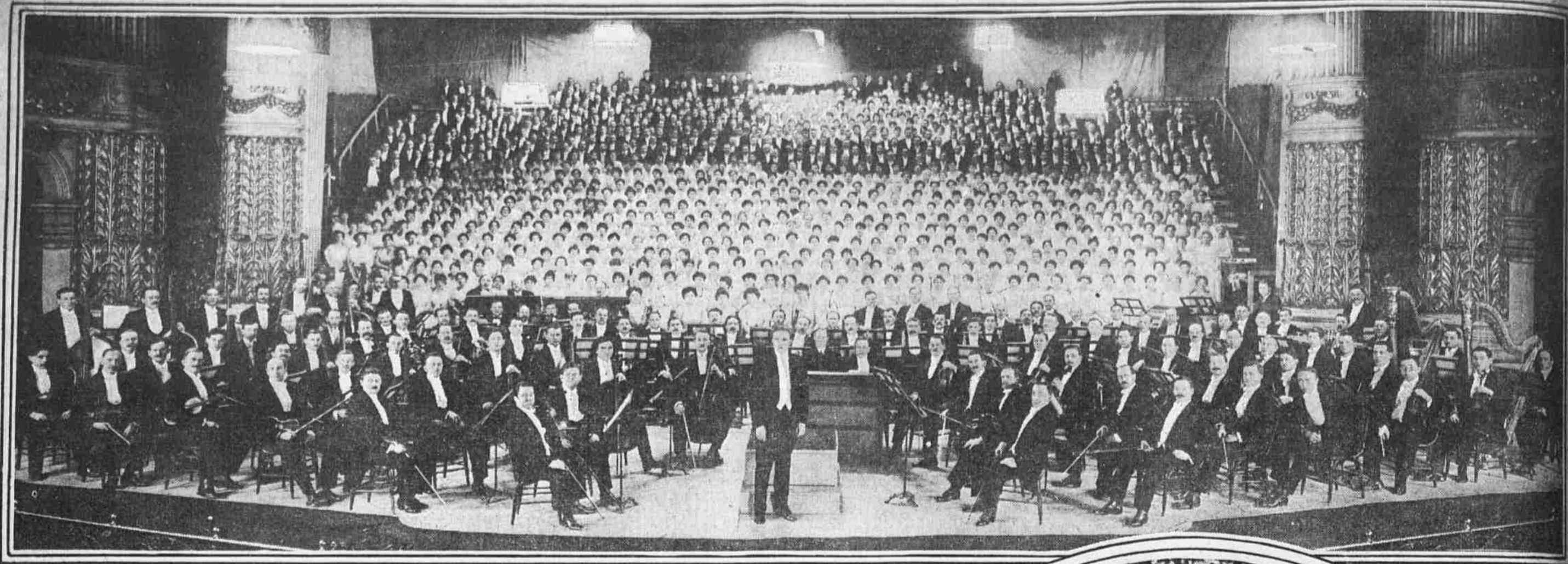
PHILADELPHIA ORCHESTRA AND CHORUS WHICH LAST NIGHT GAVE MAHLER'S EIGHTH SYMPHONY FOR FIRST TIME IN AMERICA

NOTES AND COMMENT ON THE NEWS OF THE DAY AS GRAPHICALLY TOLD BY THE CAMERA