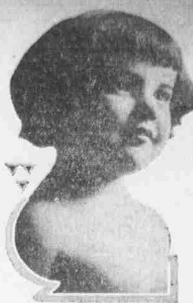
MARIE OSBORNE. This little lady is the star of the new Pathe release, "Little Mary Sunshine."

Little Marie Osborne as Mary is perfectly adorable. Natural in action and pretty to look upon, she is the star of the piece. There is an extremely clever scene where she dreams that she plays with the bear and gives Brain a bath. It shows what a versatile little lady Miss Marie is. The other principals are very good. Henry King, of "What Pasa?" fame, is attractive as the hero and has an exceedingly pretty leading lady in Marguerite Nichols.