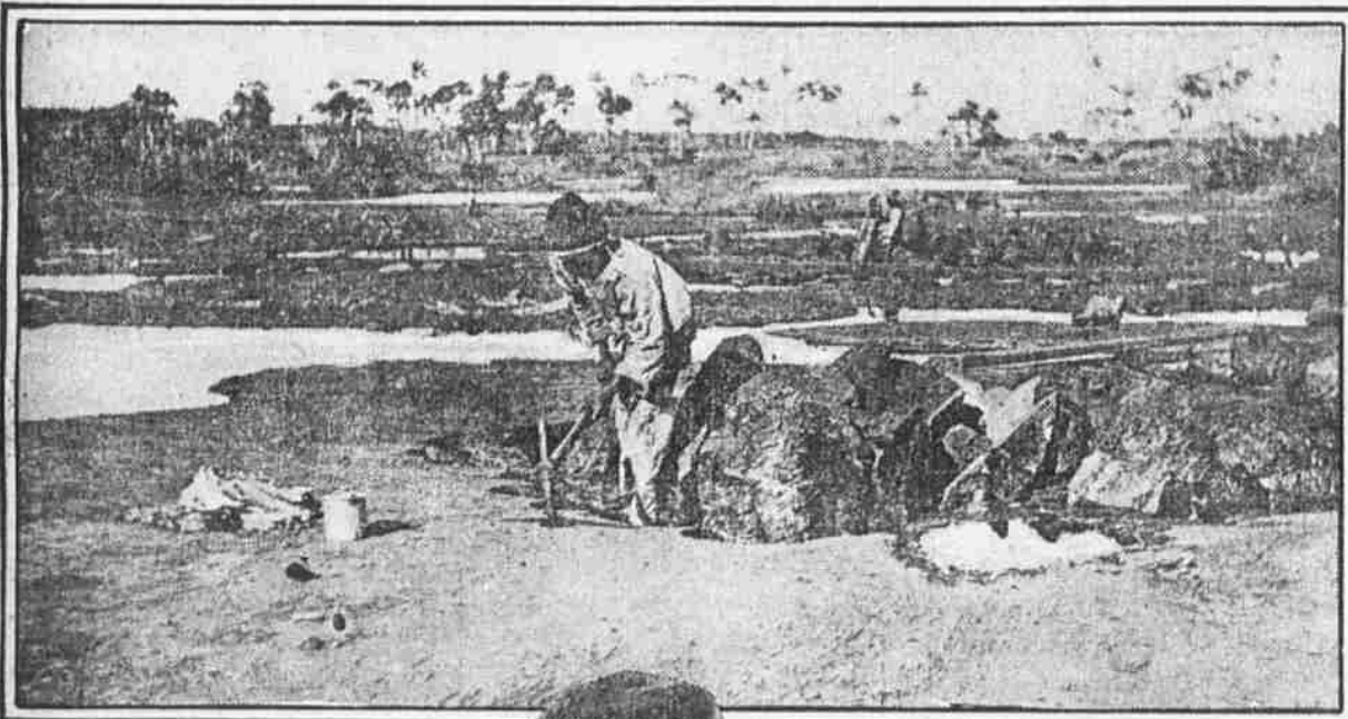
WHERE ROOSEVELT IS SEEKING REST Here is a West Indian native digging solid bitumen at the famous Trinidad Lake, from which the Barber Asphalt Paving Company has been mining material for 35 years without making a respectable dent in its surface.