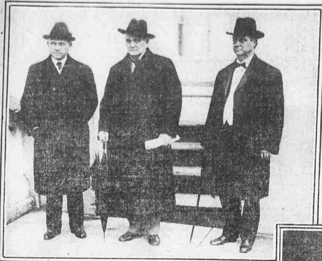
HOUSE LEADERS WHO ARE OPPOSING PRESIDENT'S SUBMARINE POLICY Left to right: Chairman Flood, of the Foreign Affairs Committee; Speaker Clark and Majority Leader Kitchin, just after their call on President Wilson to tell him of the House's objections to his position on the international situation.

PICTURES FROM HOME AND ABROAD THROW TIMELY SIDELIGHTS ON THE DAY'S ASSORTED NEWS