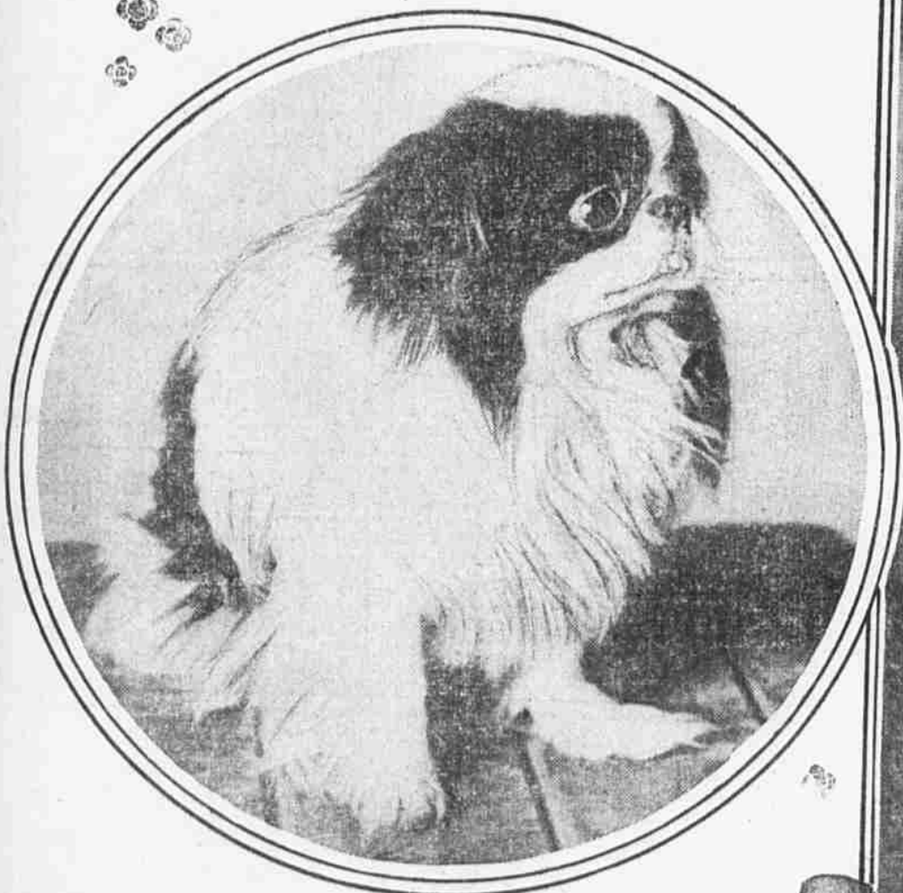
IN THE KENNEL CLUB SHOW Champion Omija, a bright Japanese spaniel from the Greenacre Kennels, who will be on view at the show which lasts through tomorrow.