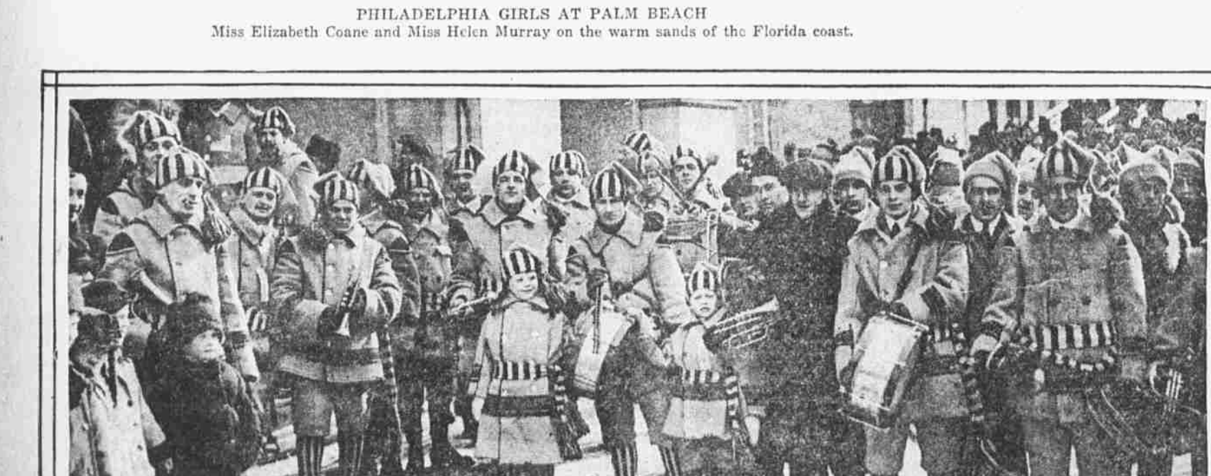
WINTER SPORTS OFFER OPPORTUNITY FOR PICTURESQUE GARB Members of the Quebec Snowshoe Club attend church services in the outdoor costumes.