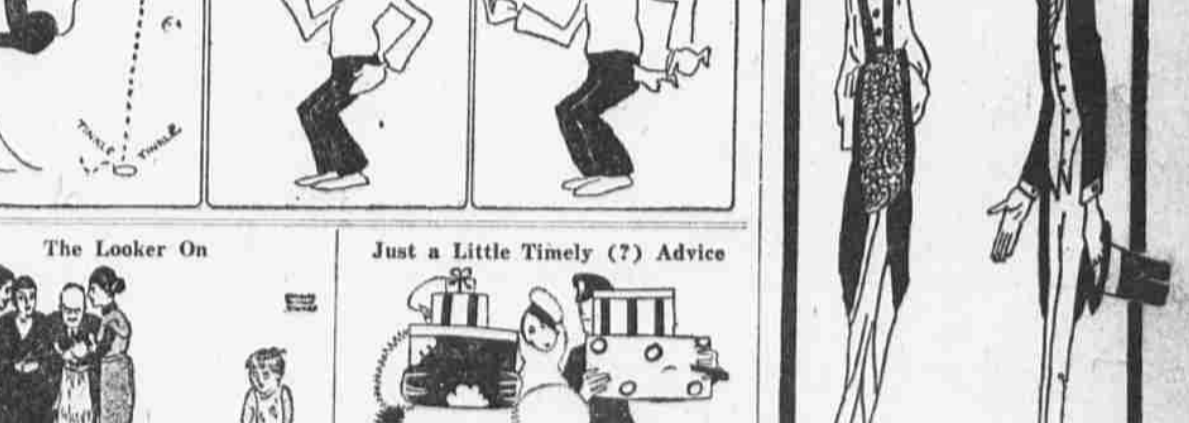
The Looker On