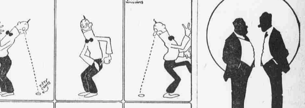
Don't you think my wife paints very nicely? Charming! It makes her look so much younger, I think.