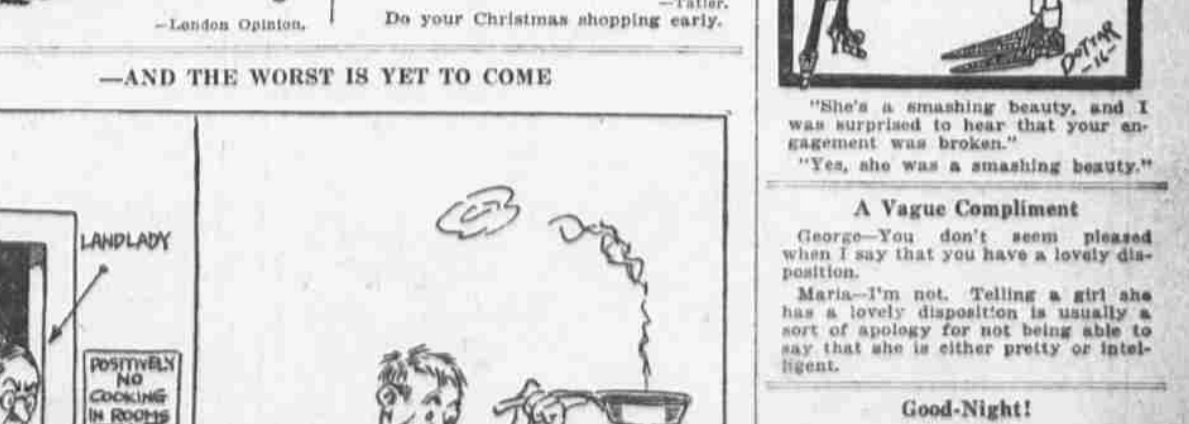
Just a Little Timely (?) Advice