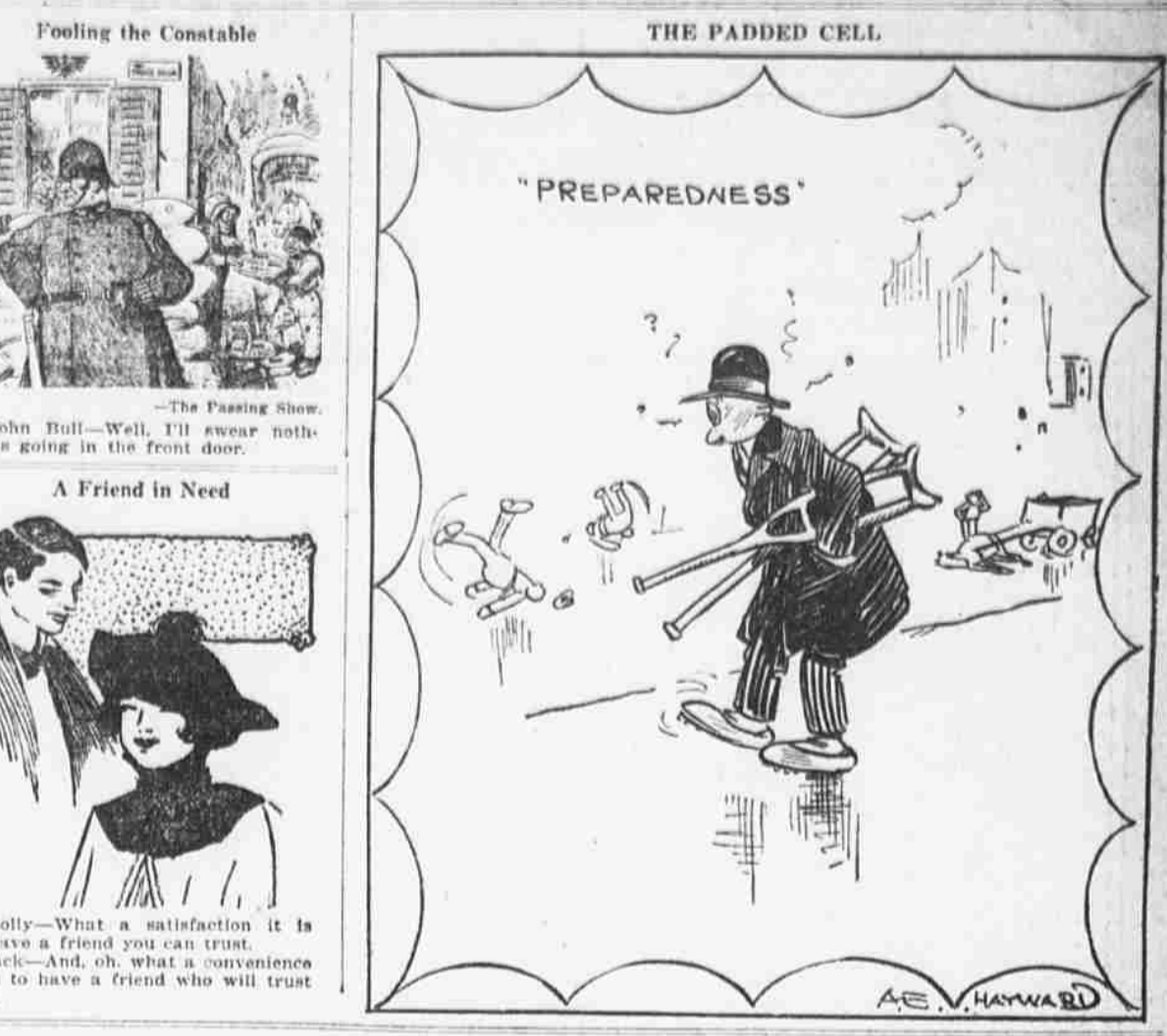
Another Way to Take It