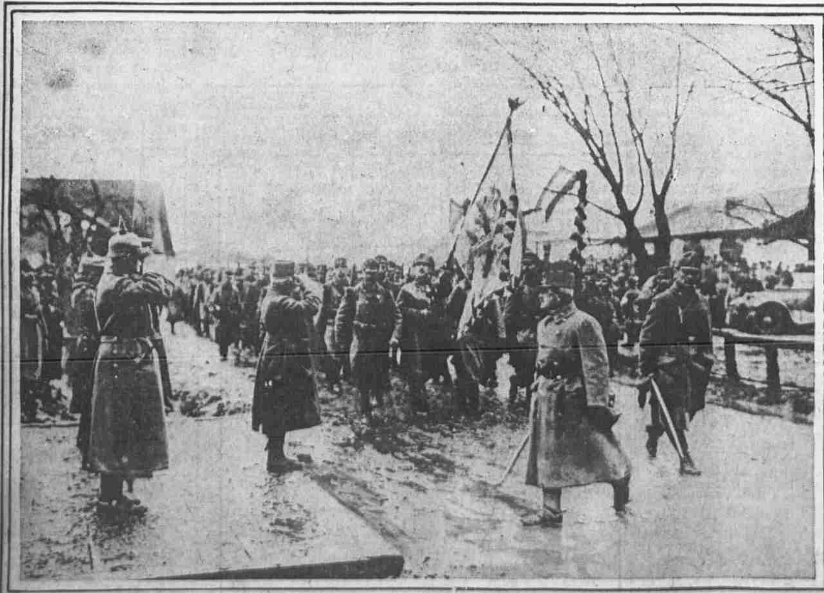
VICTORIOUS AUSTRIAN VETERANS REVIEWED BY ARCHDUKE FREDERICK The Teutonic troops under General von Bothmer, who for several months held back the Russian efforts to reinvade Galicia, were inspected on their return to Lemberg by their commander-in-chief.