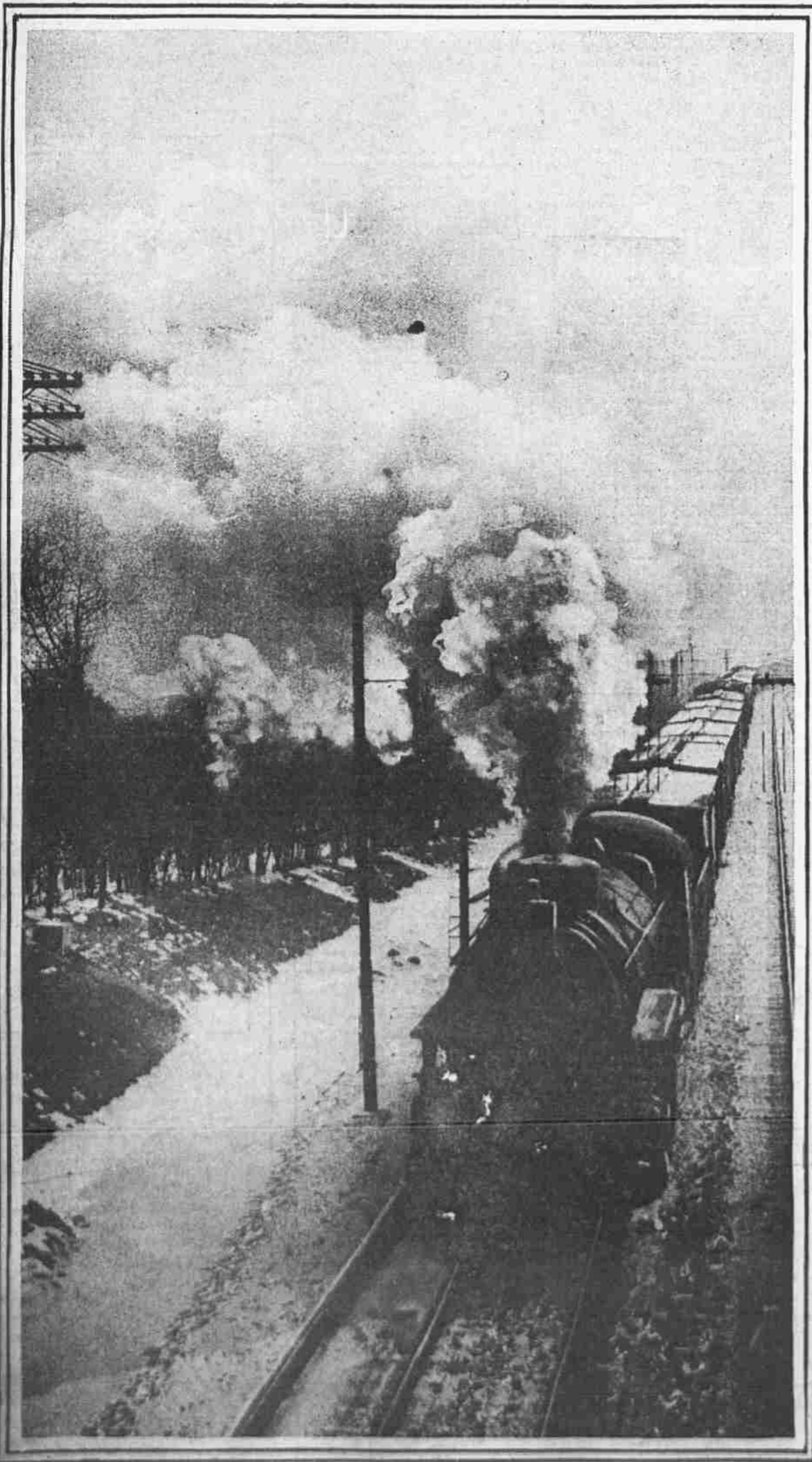
LOOKING DOWN ON THE PENNSYLVANIA RAILROAD'S TRACKS FROM THE SPRING GARDEN STREET BRIDGE