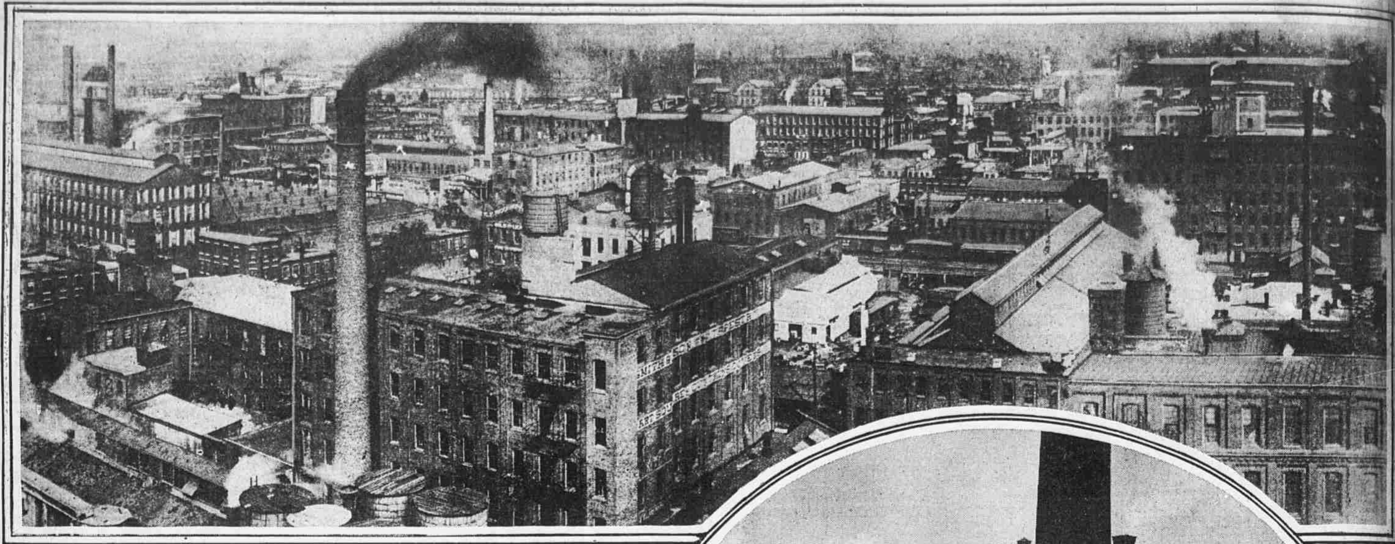
IN THE HEART OF KENSINGTON'S TEXTILE MANUFACTURING DISTRICT AT THIRD STREET AND LEHIGH AVENUE