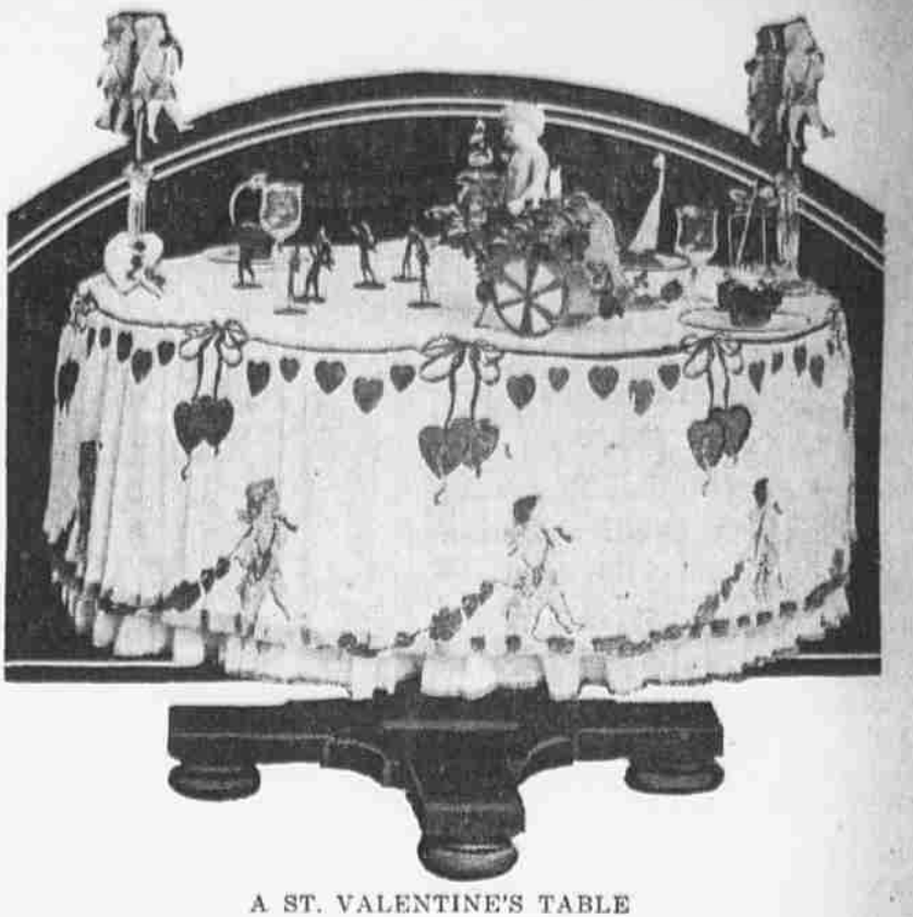
A ST. VALENTINE'S TABLE

ST. VALENTINE'S DAY is a favorite day with young people, and there is no more fitting time for announcing engagements and giving heart parties than February 14, with all that it signifies.