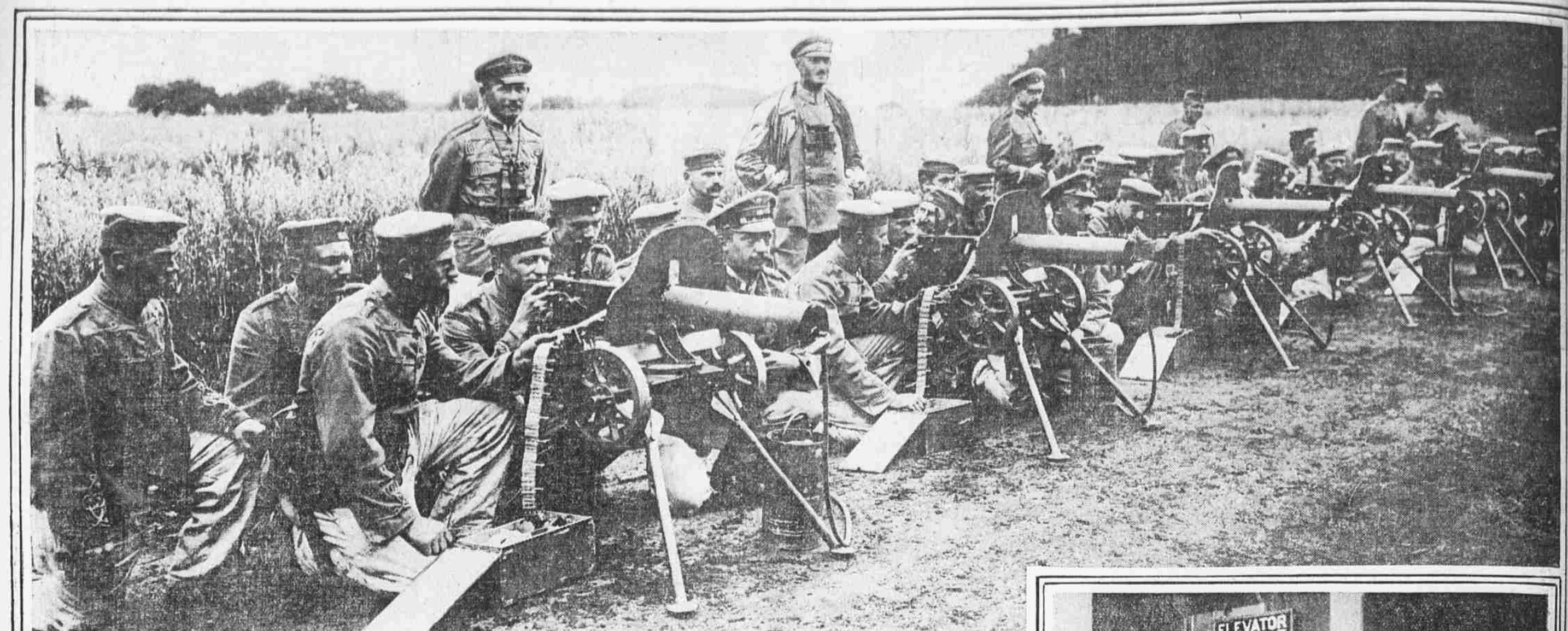
GREMANS SHOOT FRENCH WITH RUSSIAN MACHINE GUNS When the Teuton armies took fort after fort in Poland they captured an enormous quantity of guns and ammunition. The picture shows some of the Maxim guns taken at Novo-Georgievsk turned against the French at Tiriancourt, on the western front.