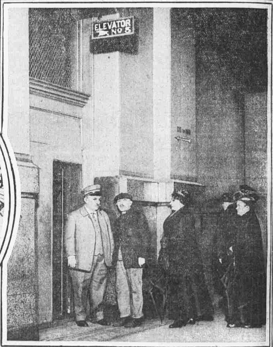
"HONEYMOON" ELEVATOR BECOMES AN EXPRESS The big car in the northeast tower of City Hall now shoots from the first to the sixth floor, so brides and bridegrooms seeking the license bureau on the fourth floor will have to use another elevator. The express is for the benefit of sightseers mostly.