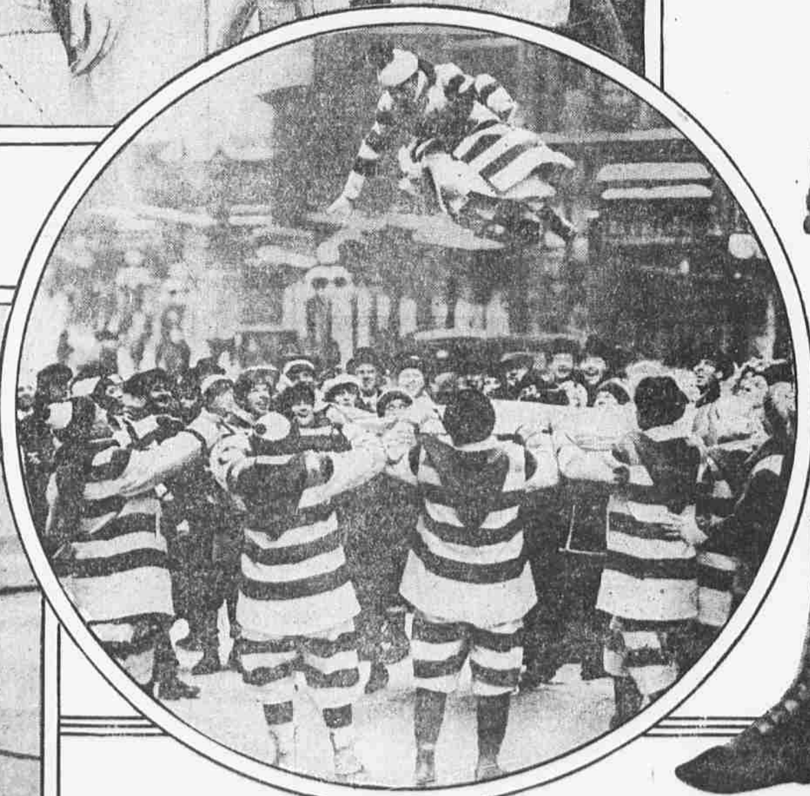
"BOUNCING" BEAUTY OF NORTHWEST WINTER SPORT CARNIVAL This event in St. Paul, Minn., corresponds to the Mummer's parade in Philadelphia. Here is the Glacier Park Marching Club's idea of paying signal honors to its queen.