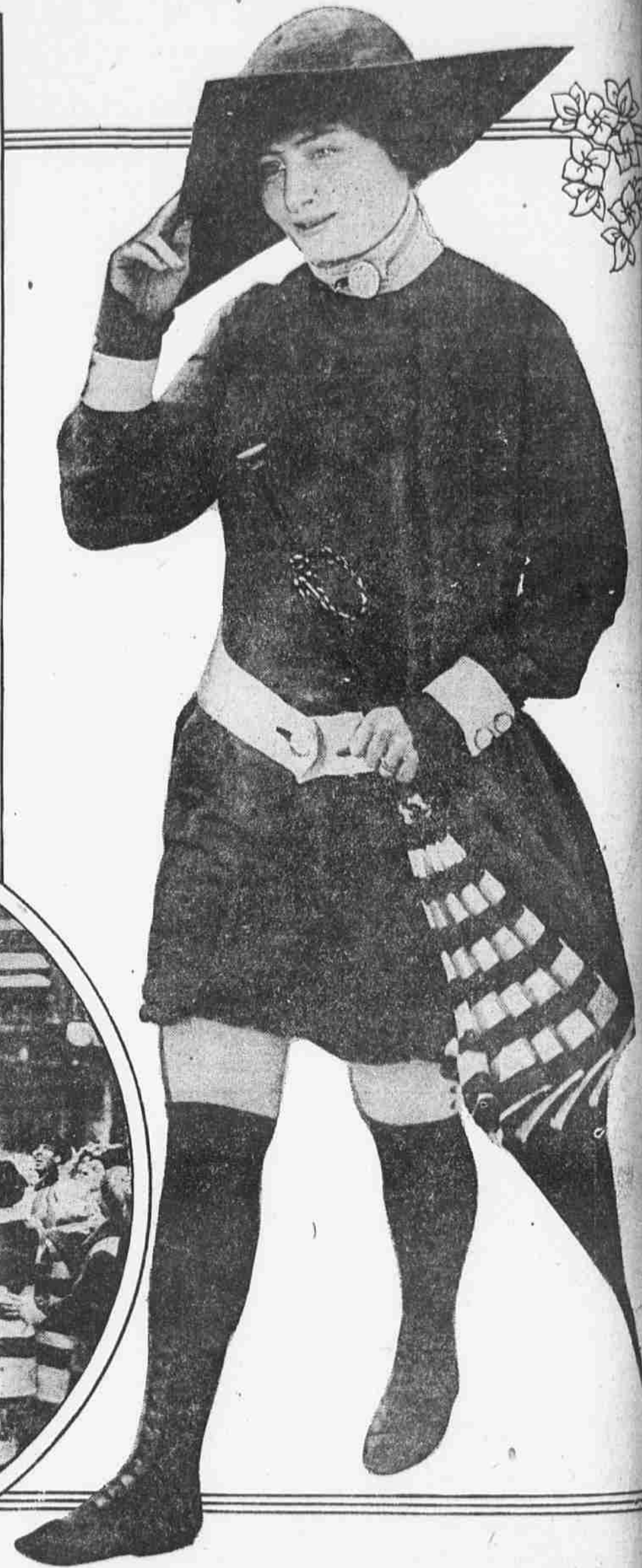
PALM BEACH'S LATEST BATHING SENSATION Every year the Florida resort sees one bathing costume beside which the others pale into insignificance. "This one was worn by a New York society woman."