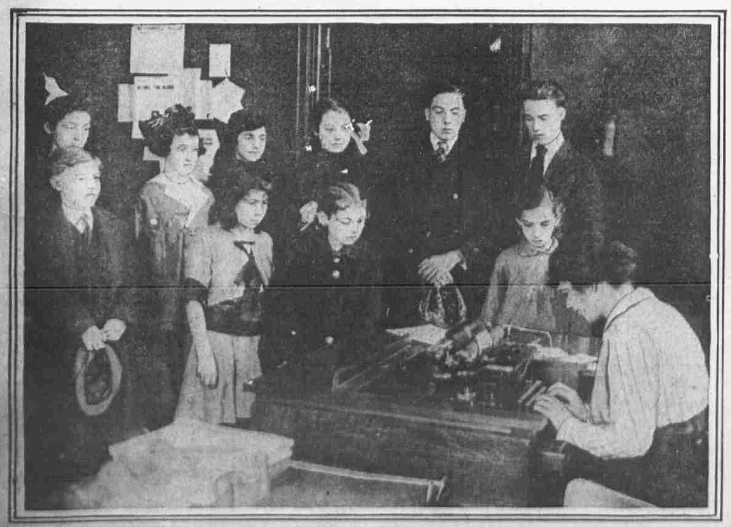
ENROLLING PUPILS FOR CONTINUATION CLASSES AT THE McCALL SCHOOL. The State law which became effective January 1 provides that children between the ages of 14 and 16 who have working cortificates must have at least 8 hours schooling a week and arrangements are being made at many institutions to provide this.