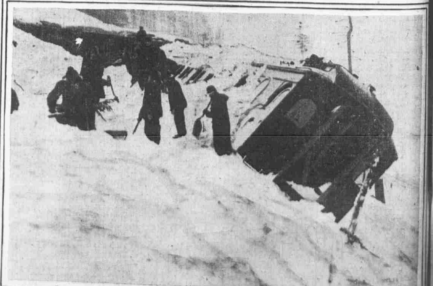
FAST EXPRESS TRAIN ON GREAT NORTHERN RAILWAY STRUCK BY SNOWSLIDE AND ROLLED DOWN MOUNTAINSIDE Six persons lost their lives and several were injured when the "Cascade Limited" was overtaken by this catastrophe in the Cascade Mountains on the line to Seattle, Wash. These pictures were taken as the buried passengers were being dug out. That at the left shows how the rear end of the train was cut off by the slide, leaving part of it hanging on the mountain side. The picture at the right shows the dining car, in which most of the lives were lost.