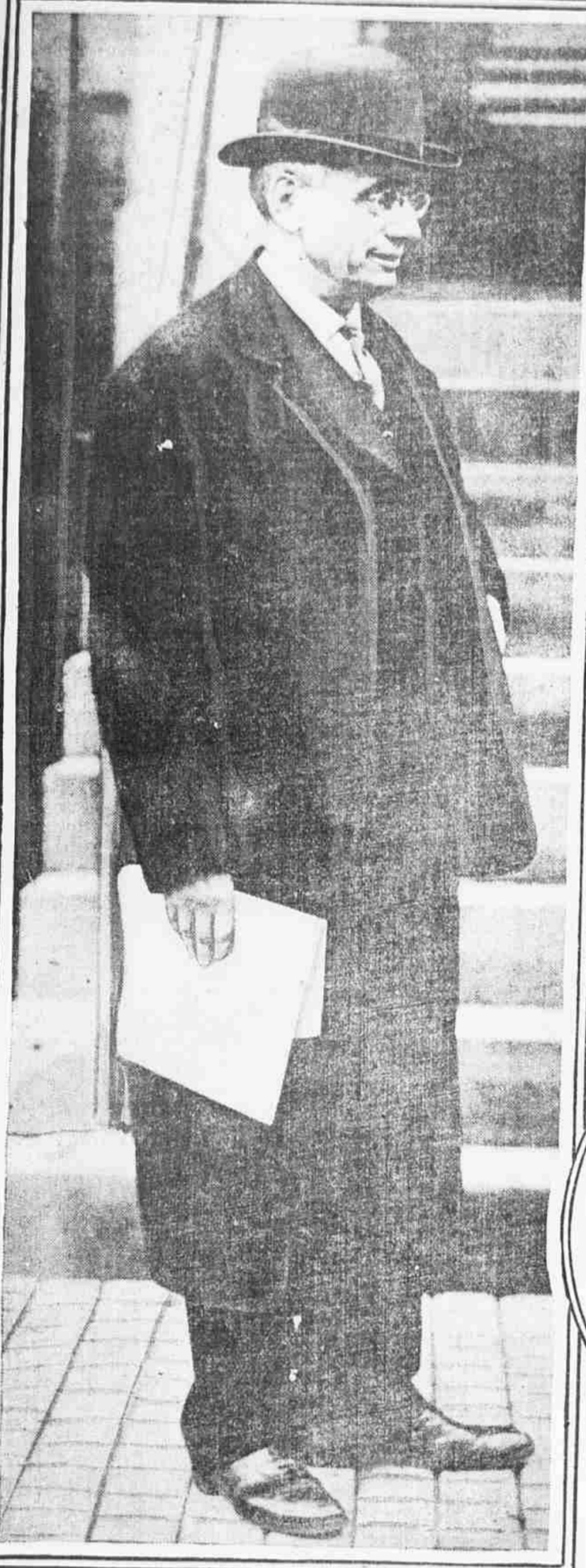
LOUIS DEMBITZ BRANDEIS A street snapshot of the Bostonian recently named for the Supreme Court, showing what manner of man he is.

SIDELIGHTS ON THE NEWS OF THE DAY AS GATHERED BY THE EVER-PRESENT CAMERA MAN