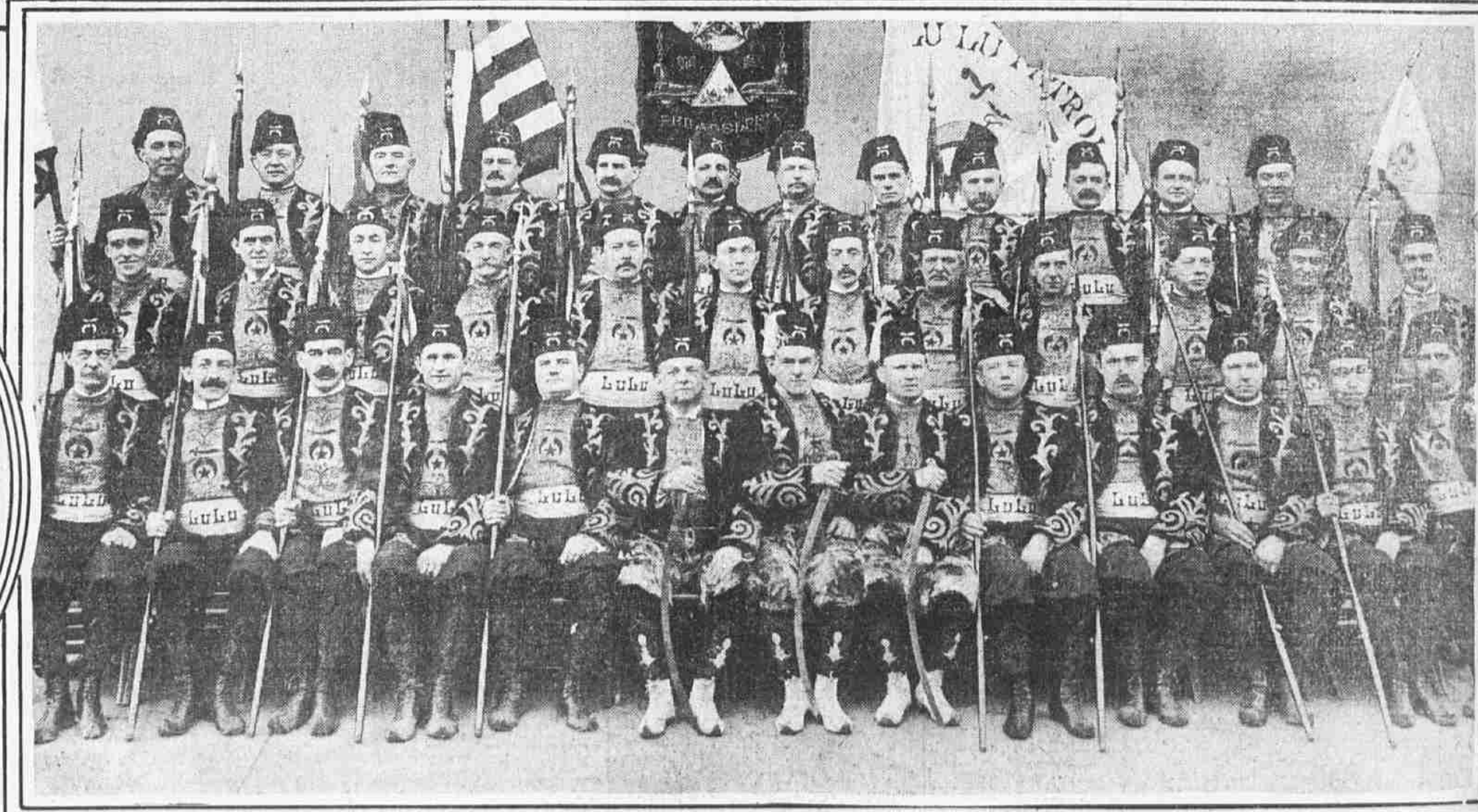
THE LU LU PATROL TO BE SEEN IN ACTION TONIGHT One of the features of the winter circus, which is to open in Convention Hall tonight, will be the appearance of this noted body of uniformed Shriners, whose drilling has earned them country-wide fame.