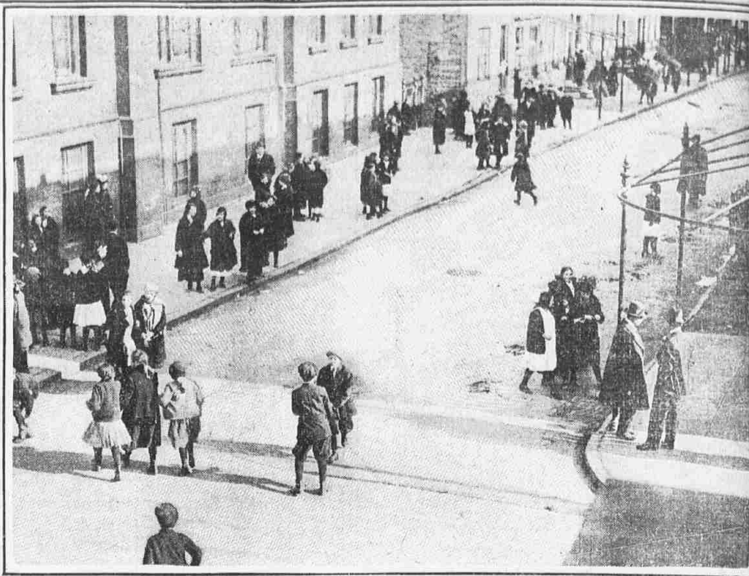
CHILDREN OF PUBLIC SCHOOL FORCED TO TAKE RECESS PERIODS Because a schoolyard has never been provided for the Campbell School, at 8th and Fitzwater streets, its pupils must take to the open streets at recess periods, where they are exposed to all the dangers that street life entails. Repeated efforts of the school heads to have this condition remedied have been in vain.