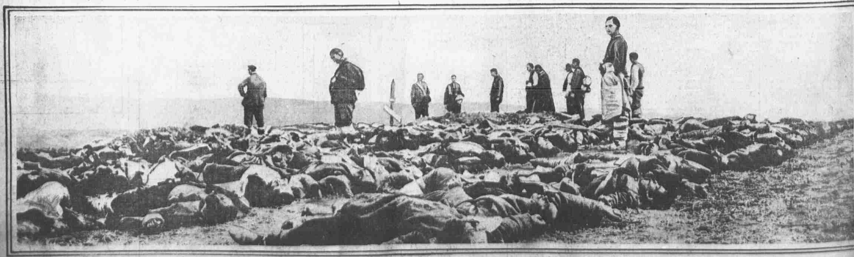
BULGARIANS COUNT THEIR DEAD AFTER A BATTLE WITH THE FRENCH IN THE DRIVE ACROSS SERBIA The soldiers of Czar Ferdinand encountered little serious opposition in their sweep across southern Serbia till they met the French expedition, composed in large part of veteran soldiers. At Mitrovitza the quick-firing light artillery from overseas played havoc in their ranks and after the combat the field was quickly sown with fallen men.