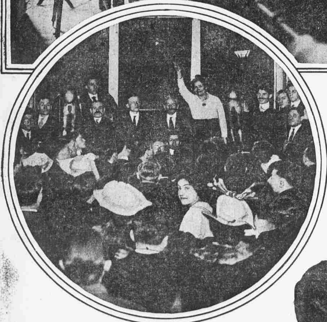
GIRLS AND BOYS WHO MAKE OUR CAPS ARE ON STRIKE. Here are the 200 young strikers holding a mass-meeting at their headquarters on North 9th street. They are being addressed by their organizer, Mrs. Ella Reeve Bloor, before going on picket duty.