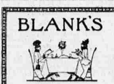
Luncheon, 50c CHICKEN CROQUETTE

threatening the life of his aunt, carrying a concenied weapon and other of-Ad ogni modo si e' riunito ora a Londra un consiglio di guerra per di scutere la situazione in Grecia, e si aspetta che gli alleati bloccheranno completamente coste greche.