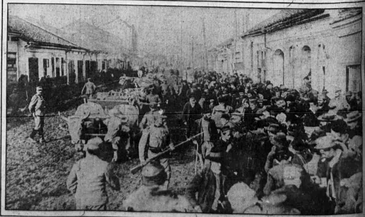
AUSTRIAN BAYONETS HOLD BACK HUNGRY SERBS AS TRANSPORT COLUMNS PASS

This picture illustrates the plight to which the Serbian civilian population came from lack of food. The invaders put their food wagons under heavy guard for fear of a sudden raid by the desperate people. In the foreground a soldier is seen with his bayonet poised for action.