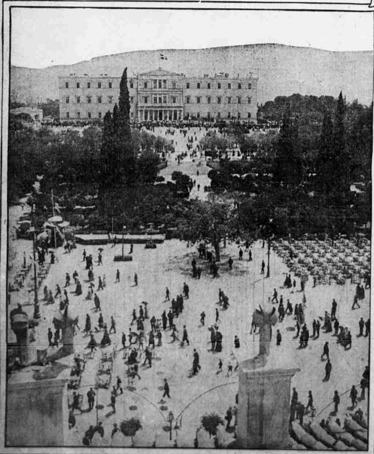
ROYAL PALACE IN THE HEART OF ATHENS

This is the residence of King Constantine in the Greek capital, which, according to German reports, may be in the hands of the Allies at any moment. It is rumored that the present crisis may force him off his throne.