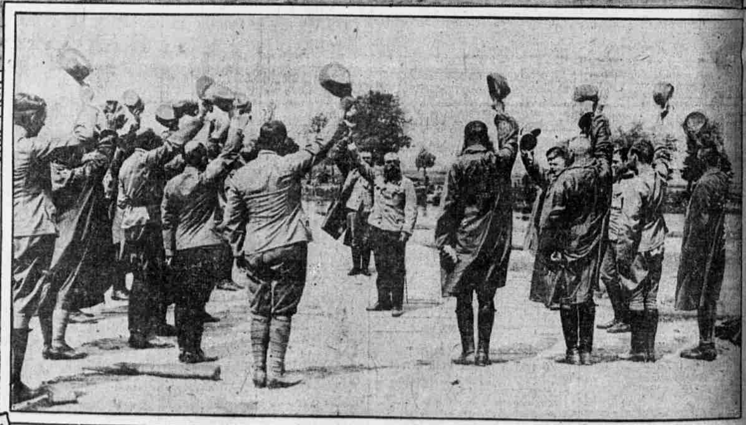
AUSTRIAN ARCHDUKE AND STAFF OFFICERS CHEER AS THEY CROSS RUSSIAN BORDER Archduke Ferdinand (wearing side whiskers) commanded an Austro-Hungarian division that forged its way north from Galicia. As they set foot on enemy soil they raised their caps with a "Hech!"

This is the residence of King Constantine in the Greek capital, which, according to German reports, may be in the hands of the Allies at any moment. It is rumored that the present crisis may force him off his throne.