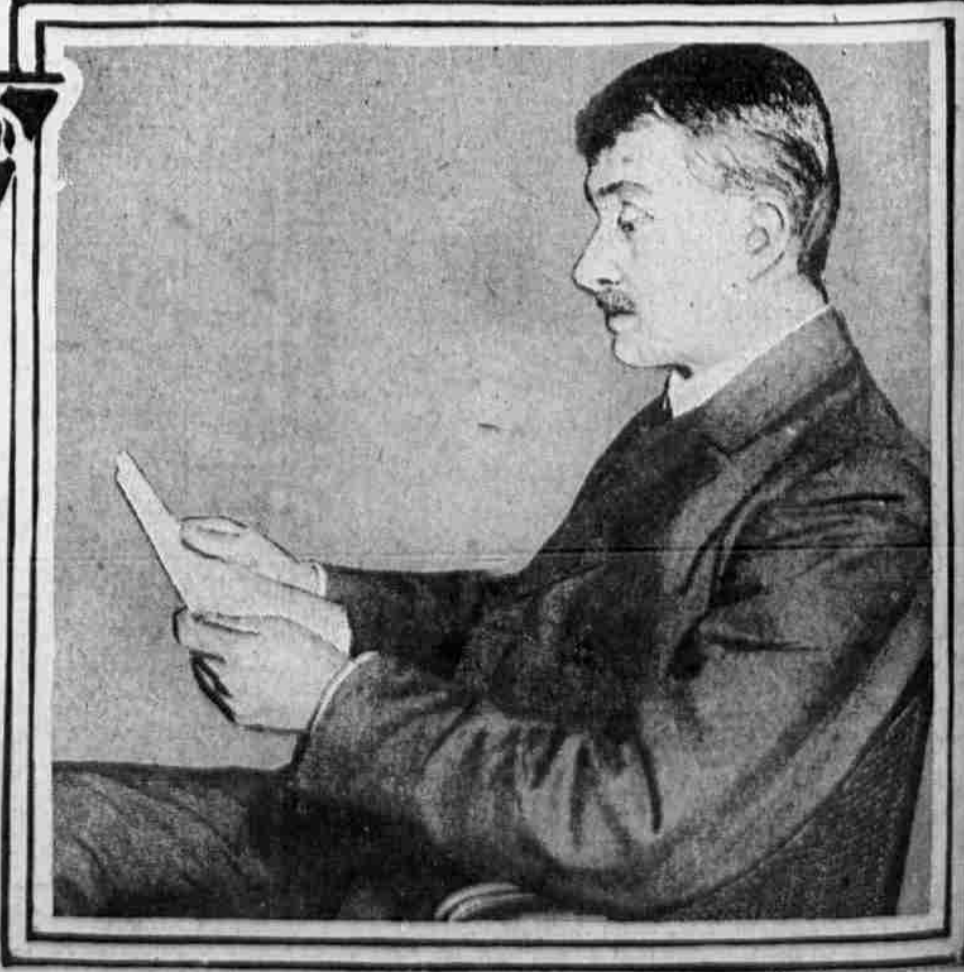
JOHN MASEFIELD The former New York hobo and British sailor, now a prosperous poet, who is to lecture in this city within the next few days.