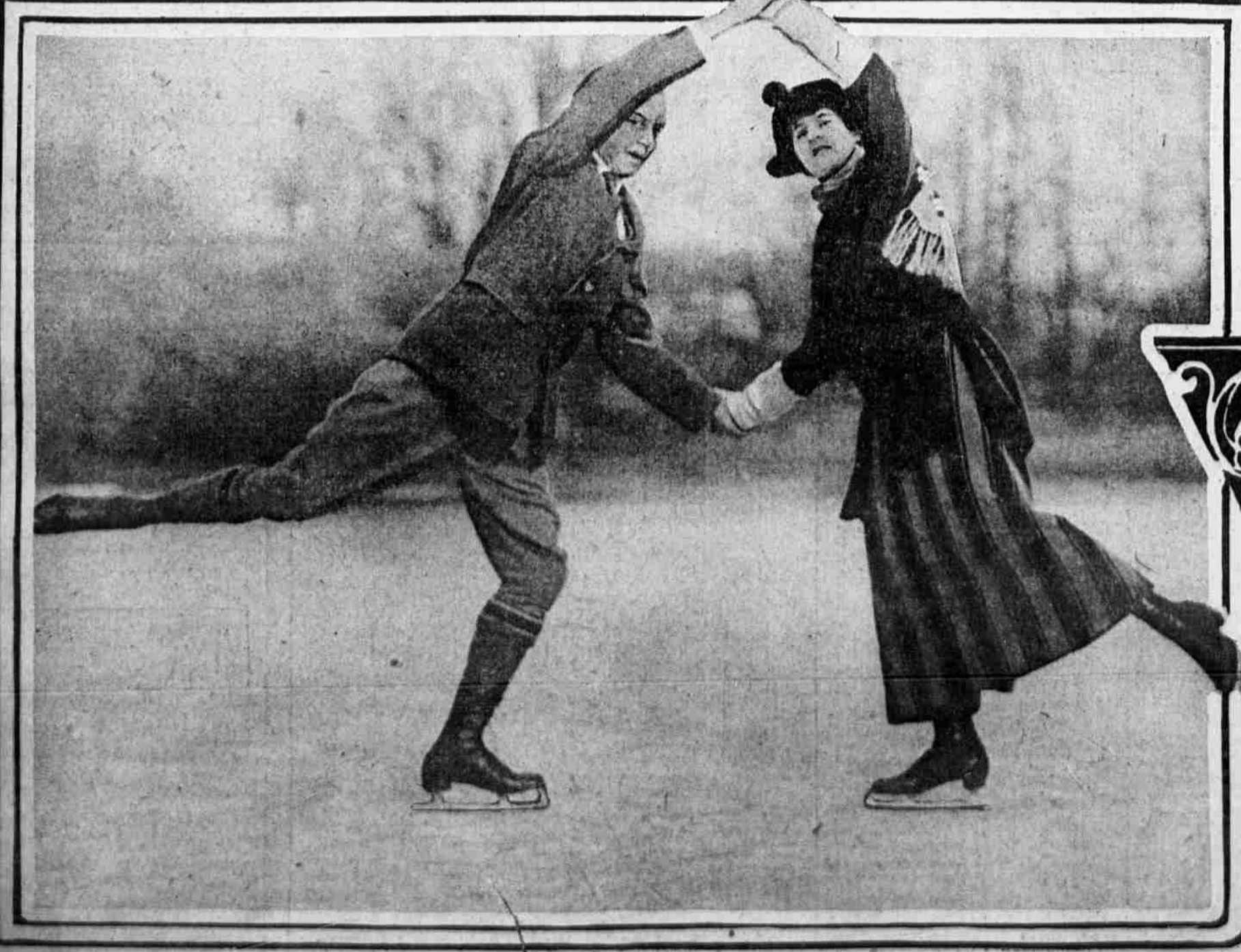
EASY WHEN YOU KNOW HOW A mercury spiral illustrated by Mr. and Mrs. Chapman, showing what can be done with a little practice. However, to perform these figures gracefully, you must have a whole lake to yourself.