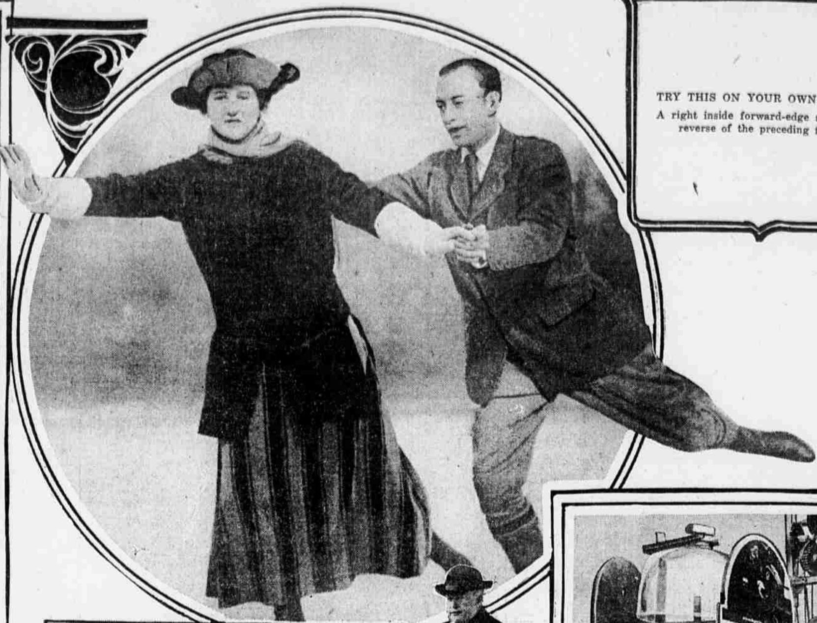
TRY THIS ON YOUR OWN SKATES A right inside forward-edge spiral, the reverse of the preceding figure.