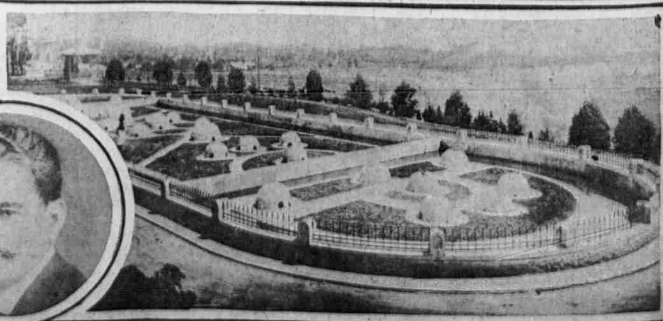
BRAZILIAN SCIENTIST RUNS BIG FARM OF POISONOUS SNAKES Dr. Vital Brasil, of Sao Paulo, Brazil, has virtually put a stop to the loss of life by snake bite in his country through the serums he has obtained by a study of the venom he extracts from his pets.