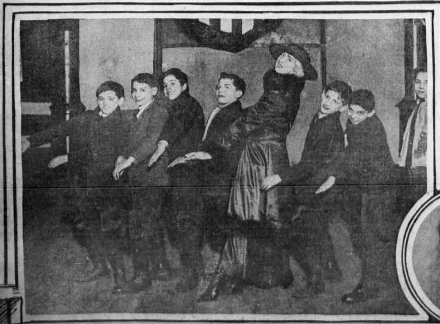
RUTH ST. DENIS, FAMOUS DANCER, TEACHES CLASS OF EAST SIDE BOYS his clever American girl, whose insipid interpretations of Oriental life draw large audiences, is now having a lot of fun by instructing pupils of a New York school in folk dances.