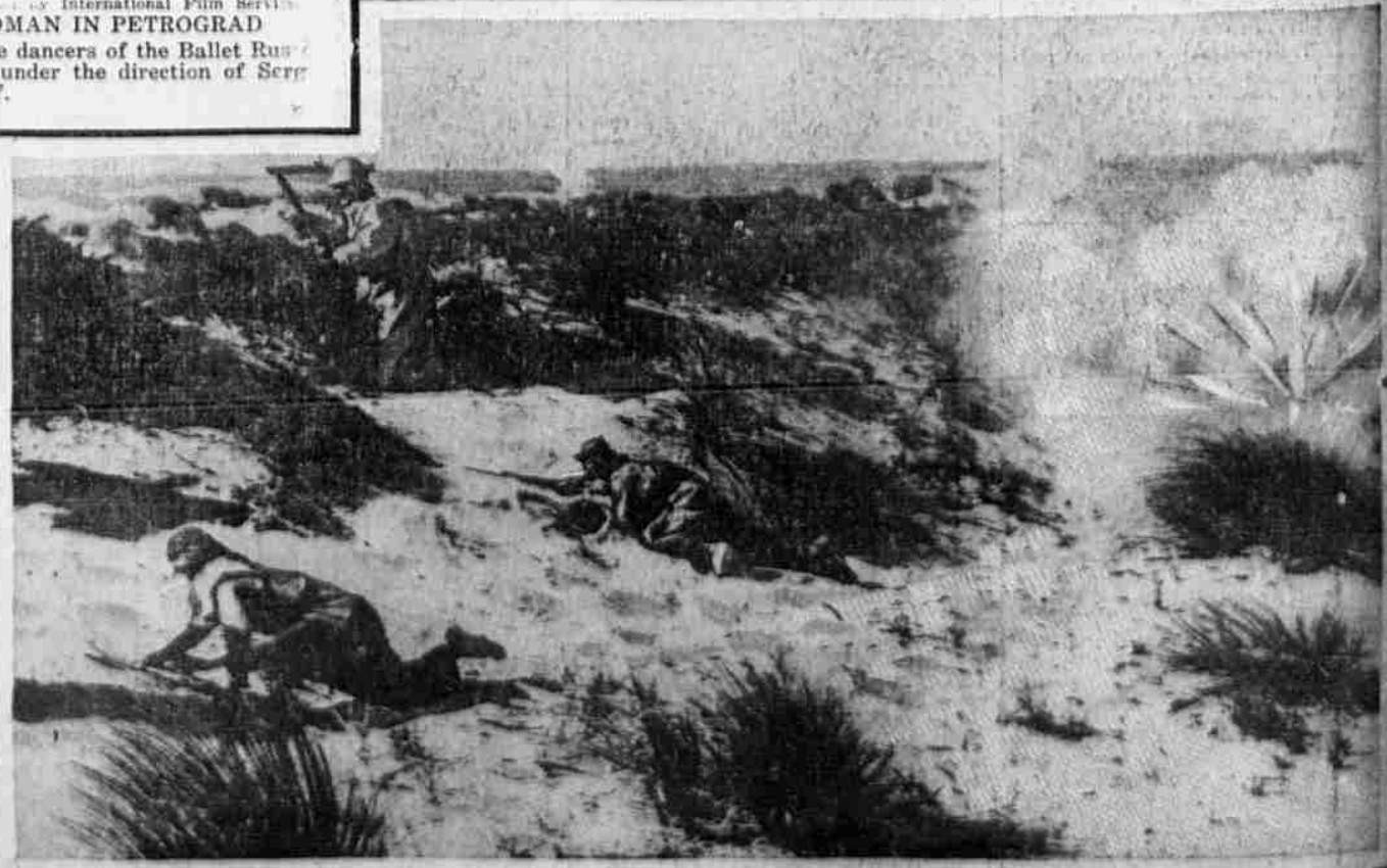
BURSTING SHELLS CAUGHT AT THE INSTANT OF EXPLOSION BY THE WAR PHOTOGRAPHER ON TWO FRONTS At the left the 220 mm. mortars of the French artillery operating in the Champagne district are shown both under fire and in action. As the mortar in the foreground is discharged a German shell bursts in a cloud of smoke and gas at the left. On the right is a newly arrived picture from the Dardanelles, showing outposts of the French forces being shelled as they make their way to safety behind the sand dunes of Gallipoli, whence the Allies have withdrawn after a series of tragic failures.