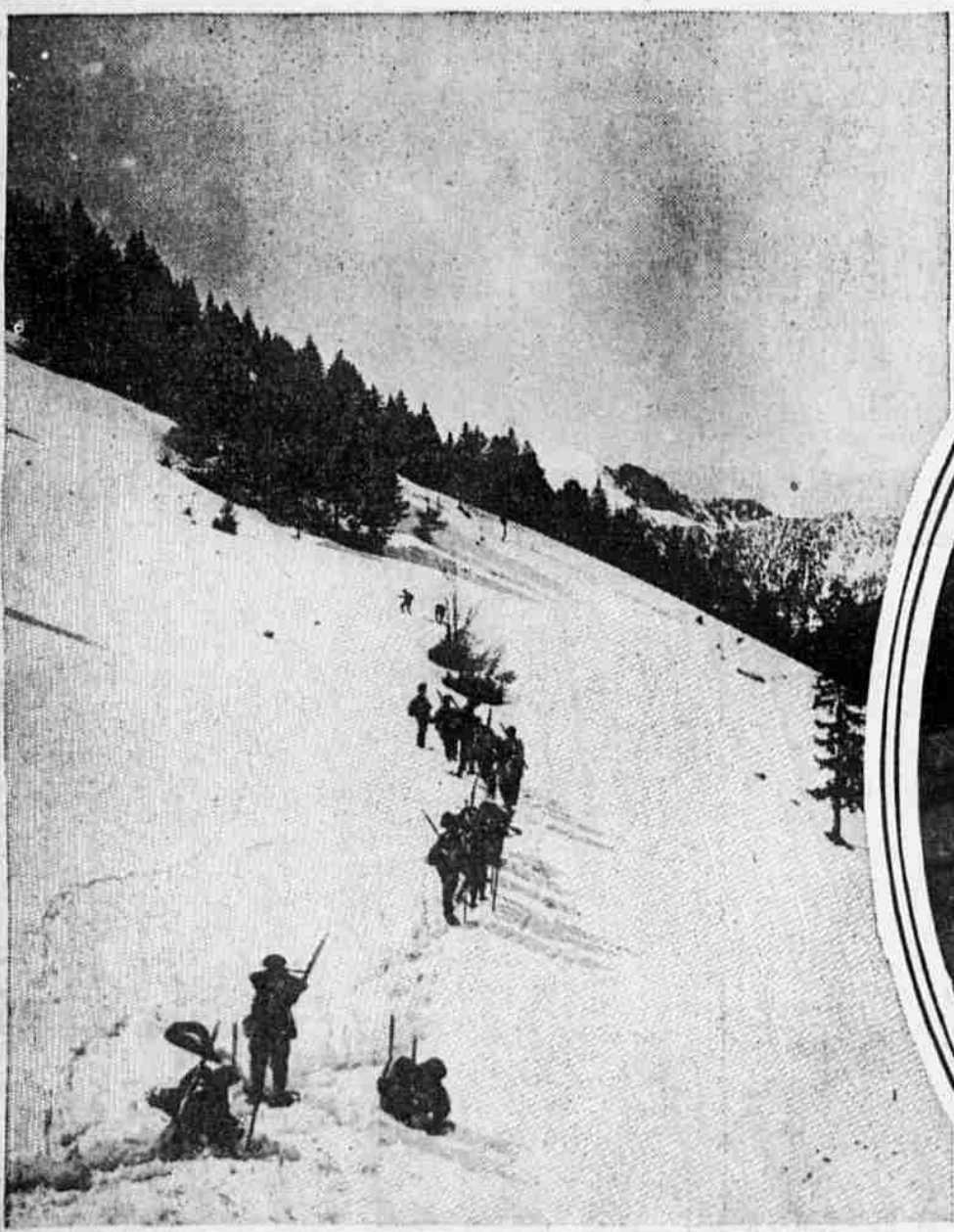
VOSGES BATTLES WAGED IN SNOW The picture shows a column of Alpine troopers, known to the enemy as "blue devils," making their way through the deep snow to the scene of action beyond the crest of the hill.