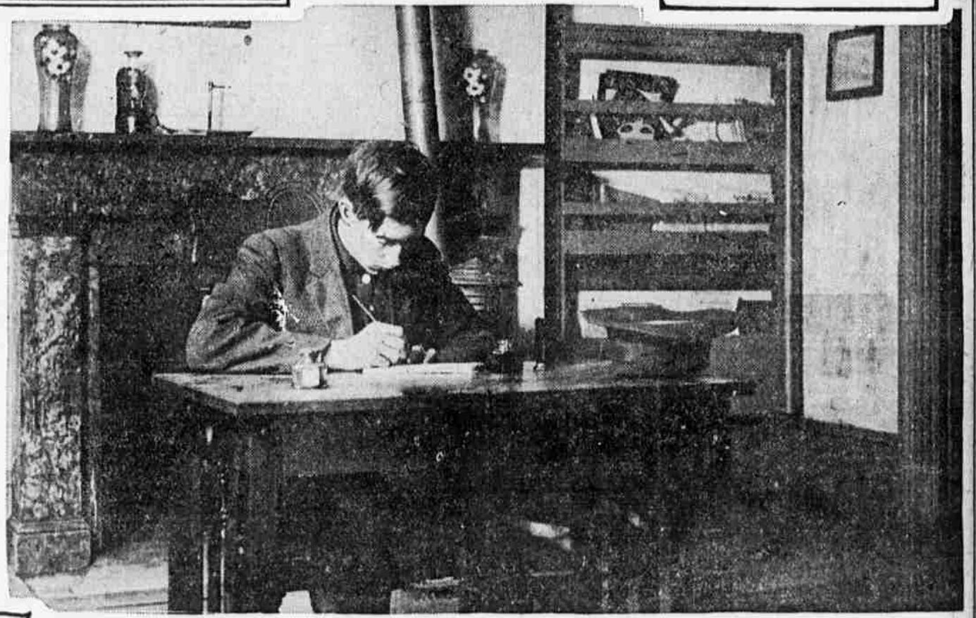
THE LIBRARY IS AN IMPORTANT FEATURE OF THE HOBES' HOTEL

The picture shows the finishing touches being put on the meeting room of the union at 486 North 5th street, where men out of work have arranged to take care of themselves and conduct their affairs without recourse to charity.