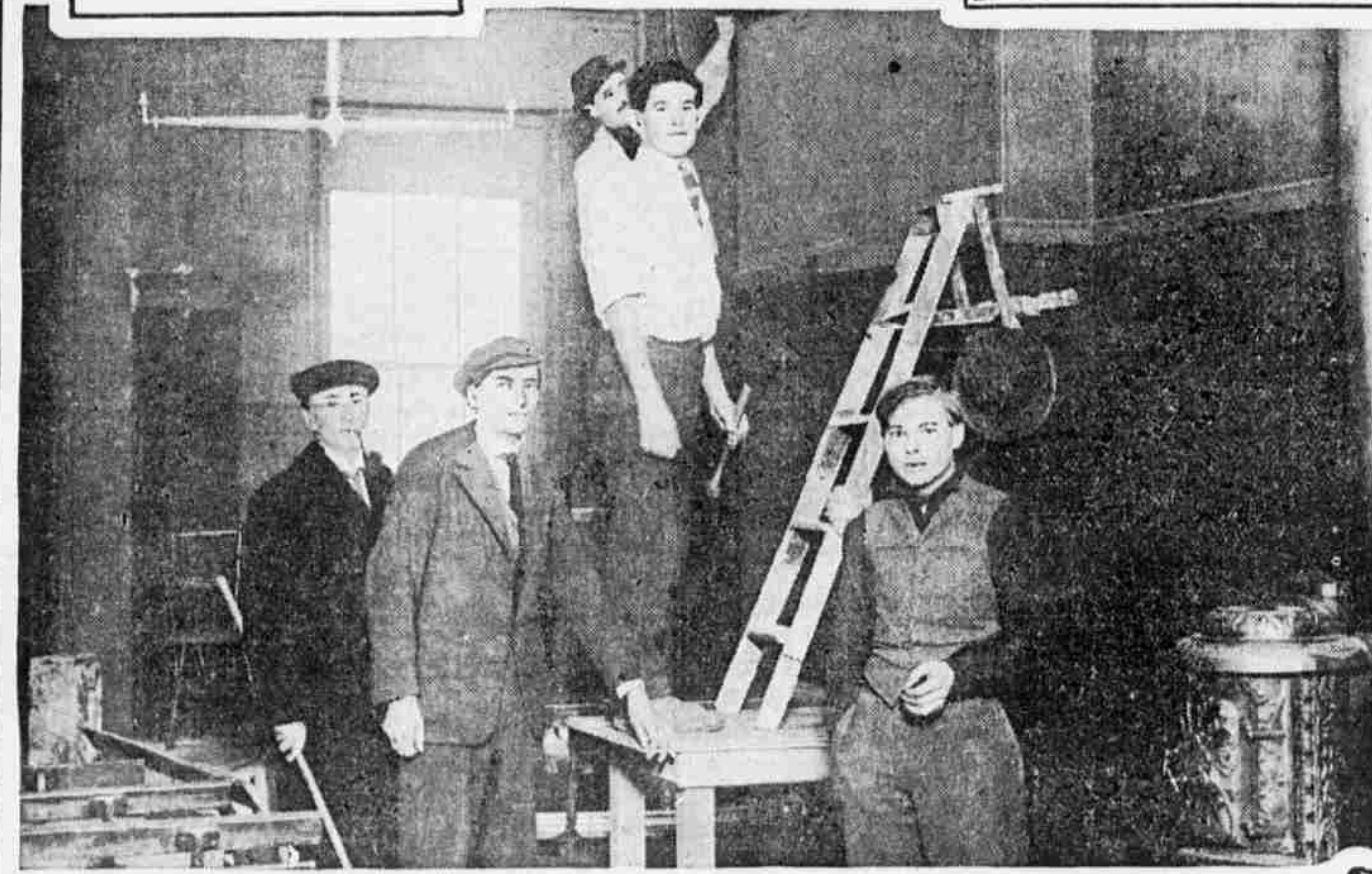
HOBES' UNION OPENS WINTER HEADQUARTERS

The picture shows the finishing touches being put on the meeting room of the union at 486 North 5th street, where men out of work have arranged to take care of themselves and conduct their affairs without recourse to charity.