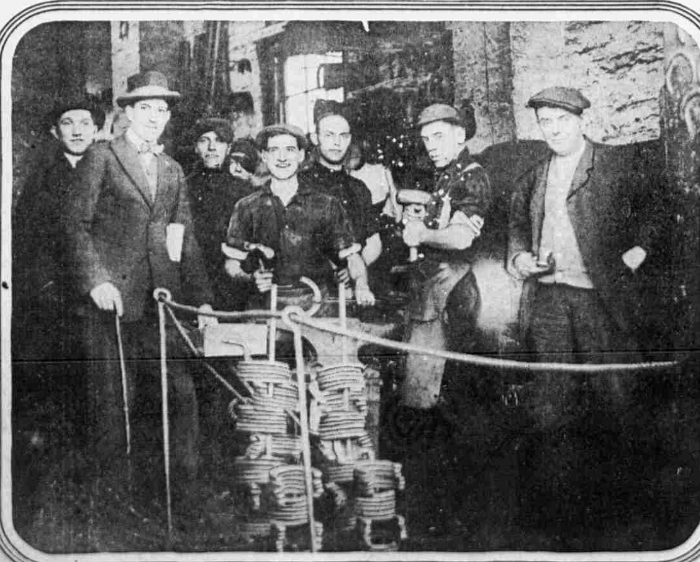
BREAKS THE WORLD'S RECORD IN HORSESHOE MAKING

Members of the union explain that a hobo is not a tramp, but a man who is able to get a job only when the season is ripe. Among them are first-class students of history and economics.