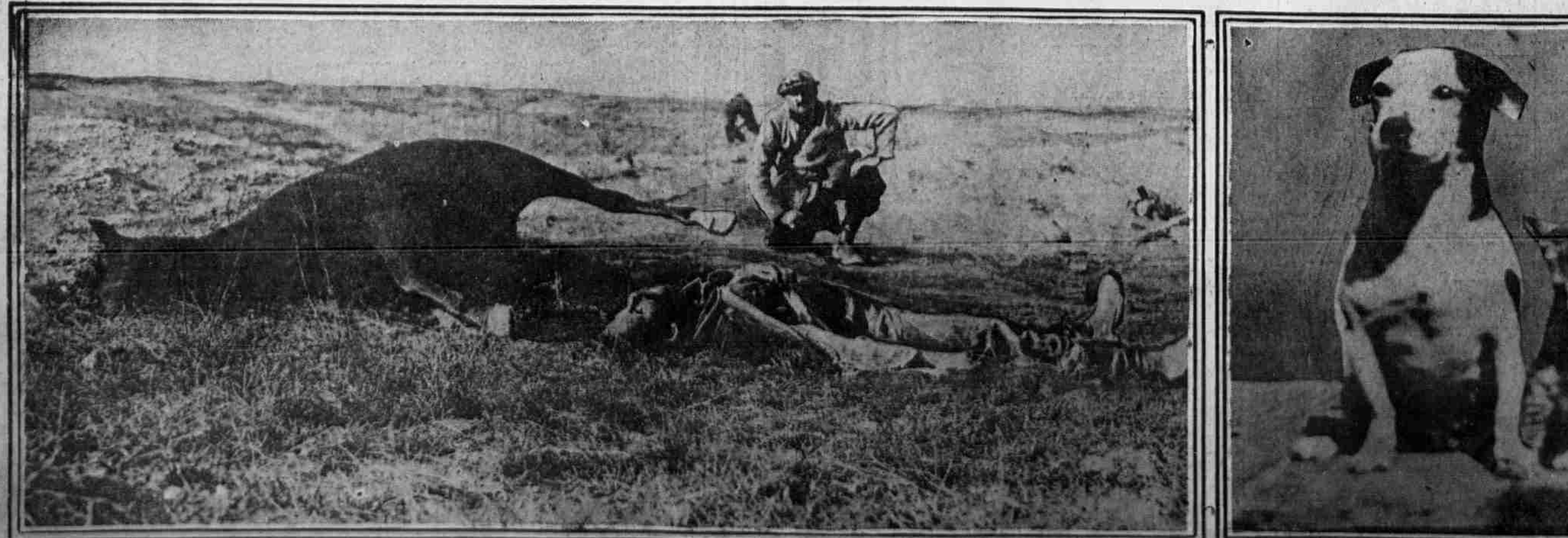
A French Red Cross worker, in exploring the battlefield after the fighting has swept to the north, finds this German cavalryman and his horse stretched stark upon the ground, victims of a random she'l.