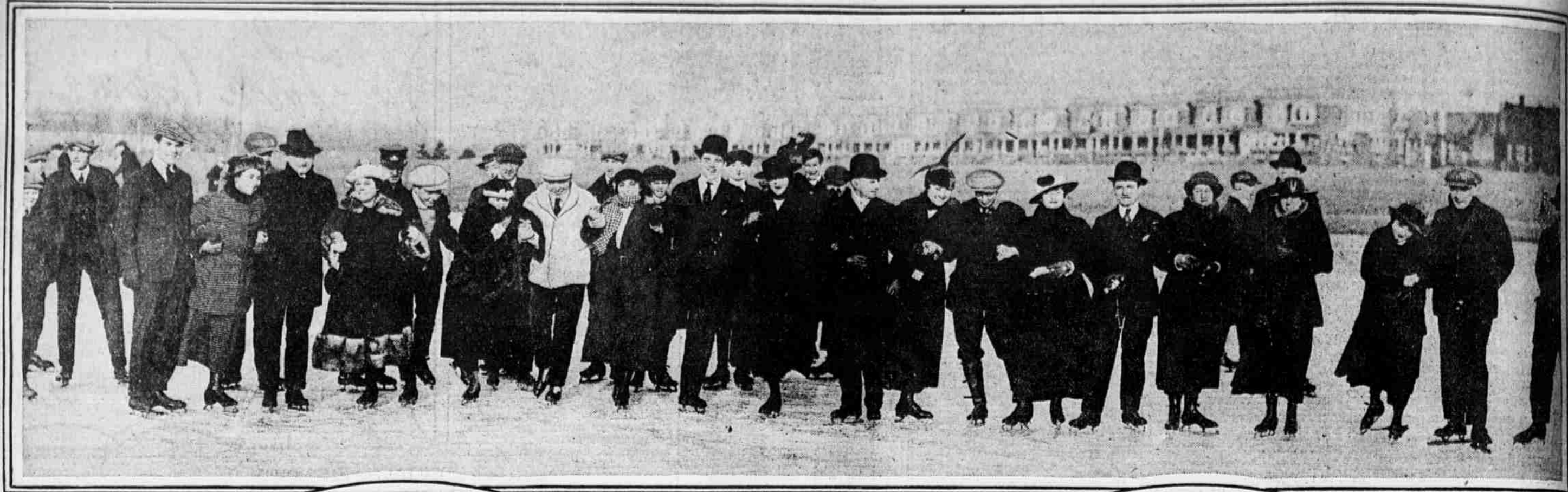
THE SKATING SEASON IS ON IN FULL BLAST According to the weather observer, the ice on the park lakes is thick enough to last through the holidays. Here is a bevy on Hunting Park Lake