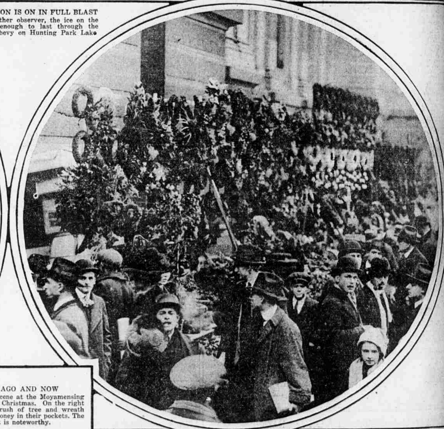
A YEAR AGO AND NOW At the left is a scene at the Moyamensing Soup Kitchen last Christmas. On the right is a last-minute rush of tree and wreath buyers, all with money in their pockets. The contrast is noteworthy.