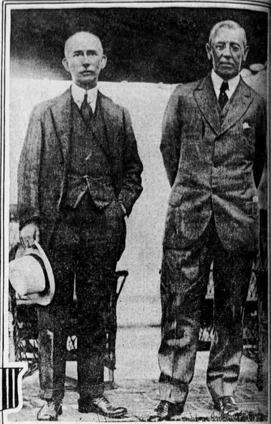
COL. HOUSE AGAIN TO "HIT TRAIL" TO EUROPE President Wilson appears here alongside of the Texas Colonel, whom he now plans to send abroad on a new confidential mission among the warring Powers.