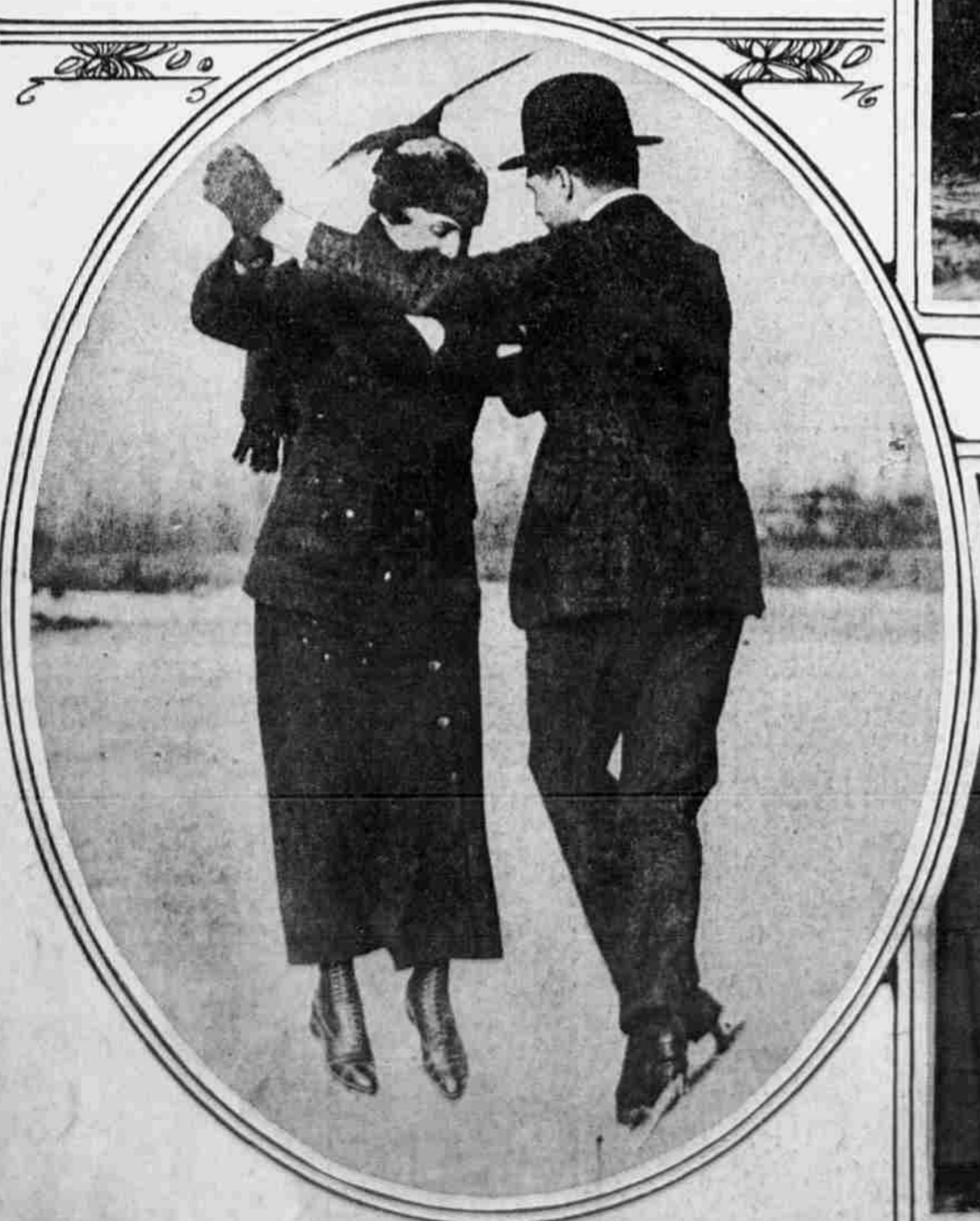
"FOX TROTTING" ON THE ICE AT HUNTING PARK LAKE This clever and skilful couple performed many graceful dance steps when the lake was thrown open yesterday.