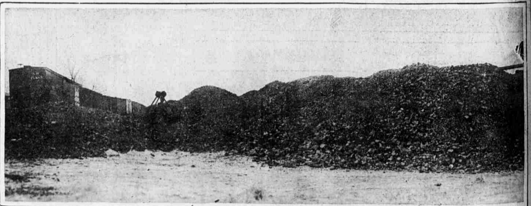
MOUNTAINS OF COAL HEAPED UP BY PENNSYLVANIA RAILROAD IN ANTICIPATION OF POSSIBLE STRIKE ON APRIL 1 These giant heaps lie alongside the tracks outside of Camden, N. J. It is rumored that the company is storing 1,000,000 tons against an emergency.