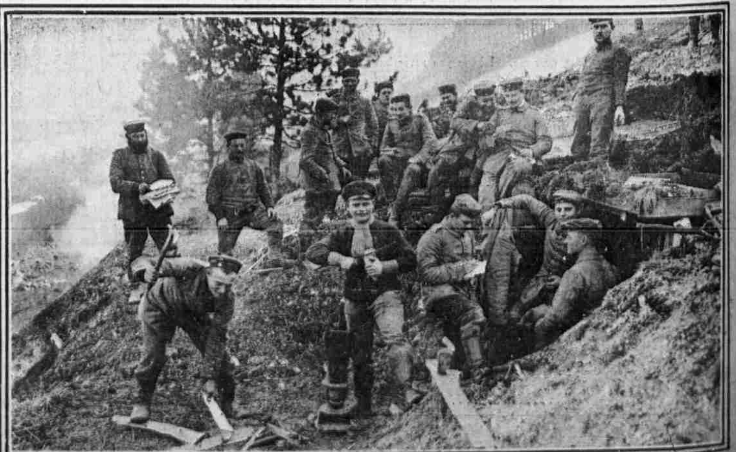
GERMANS IN FRANCE MAKE THEMSELVES COMFORTABLE FOR WINTER German troops are seen in an unconventional attitude during a respite in the campaign in the Artois region. The men are preparing a little party before the evening sets in. Note the "dug-out" which protects the soldiers from burging shells at the right.