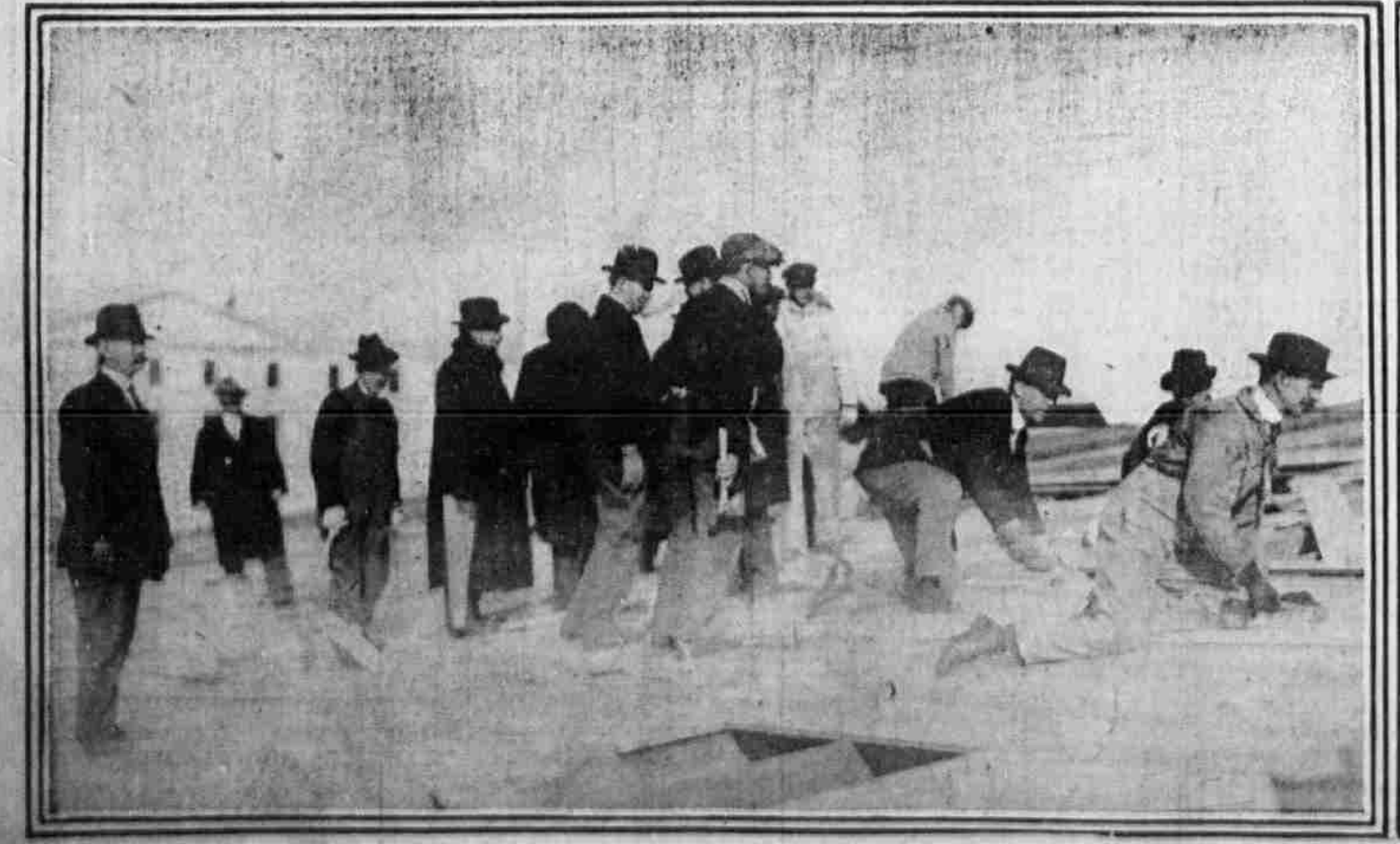
ATLANTIC CITY PASTORS FOLLOW THE EXAMPLE OF THE MEEK AND LOWLY CARPENTER Evangelist Stough will go after the Devil at the seaside resort when the New Year opens. Ministers from the various churches in the city are shown doing real "sky-pilot" work by completing the roof of the revival tabernacle.