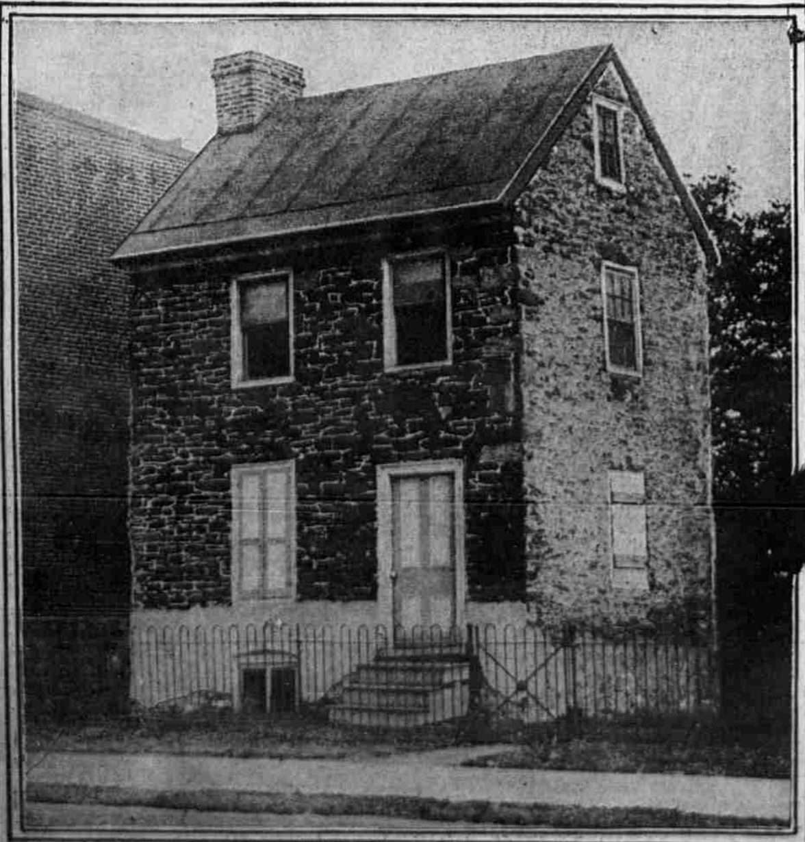
RELIC OF COLONIAL DAYS This is believed to be the smallest residence in the city, situated at Hunting Park avenue and 29th street. Its stone and mortar were characteristic of early days in Philadelphia.