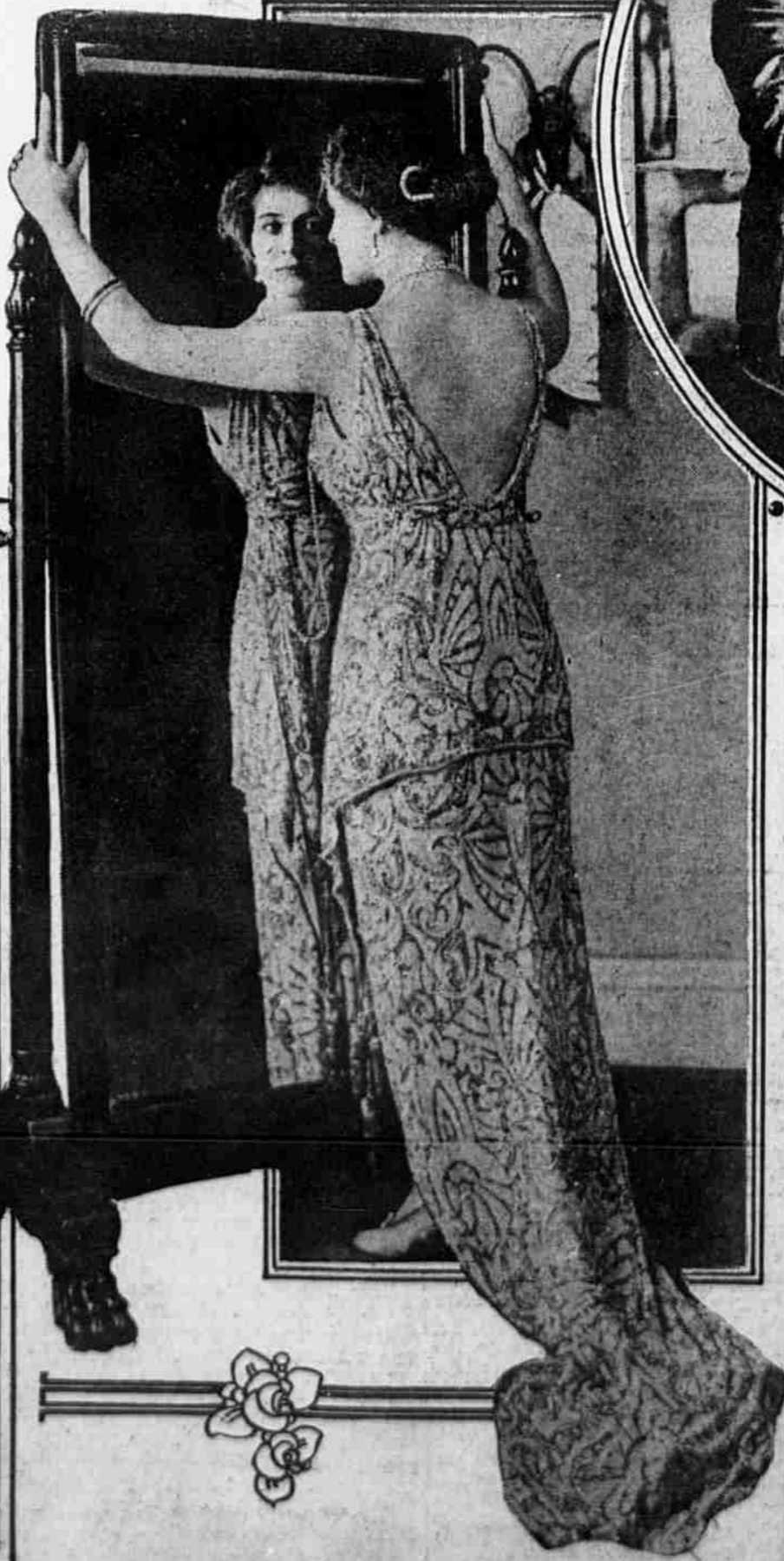
MADAME GANNA WALSEK Polish soprano who will appear as a soloist at the Russian Prazdnik this evening.