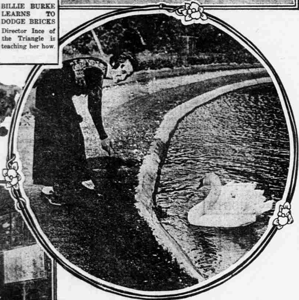
A COMPETITION IN GRACE Pavlova finds a competitor in a swan. The scene is the dancer's London home, "Ivy House."