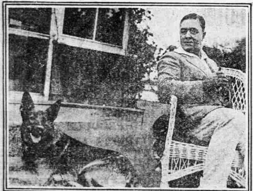
ROBERT EDESON AT EASE He is getting ready to be interviewed in the novel film, "How Molly Made Good."