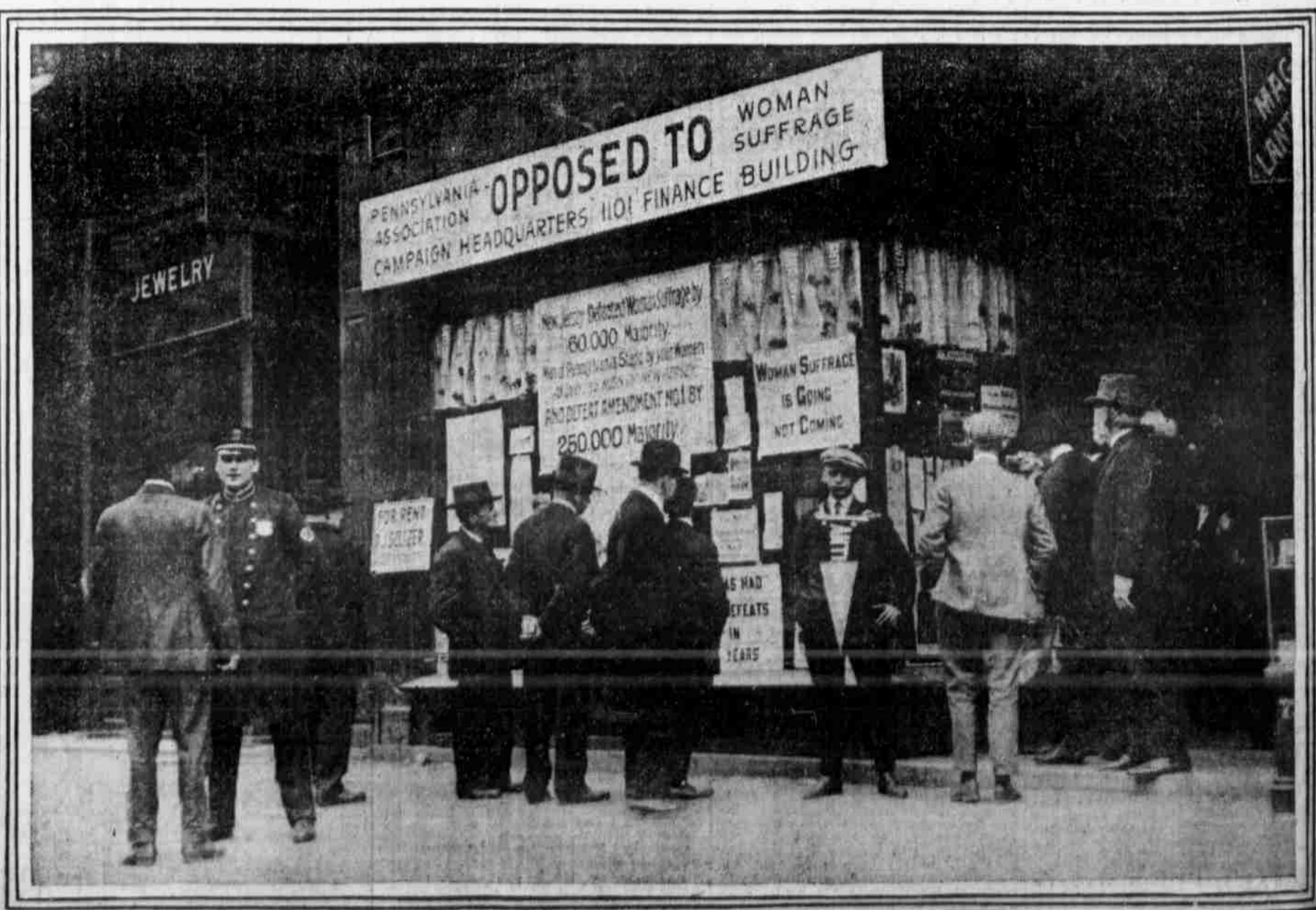
BUT, ON THE OTHER HAND, THERE IS THIS This window display, at the Anti-Suffrage shop, 728 Chestnut street, also attracts its partisans. The youngster, who is doing sandwich duty, and the other workers here are as certain that the answer will be "No" as their opponents are that it will be "Yes."