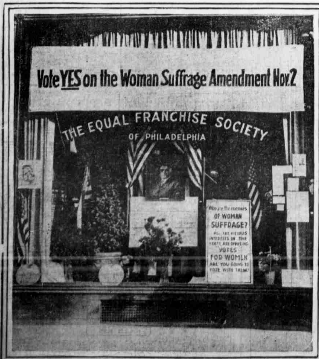
A MUTE APPEAL BY THE WOMEN FOR VOTES The Equal Franchise Society, 35 South 9th street, has an enthusiastic window decorator who changes the placards, pictures and decorations on display every few days. This is how the window looks today.