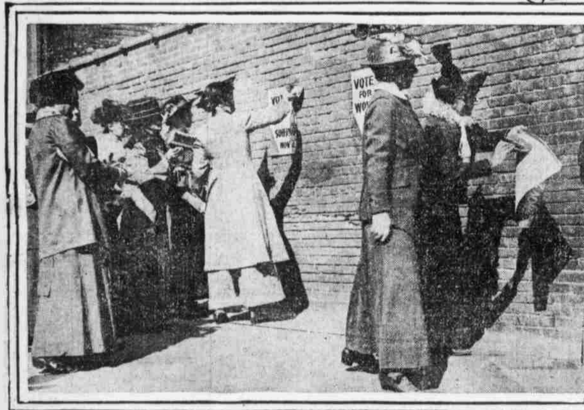
WHY OBEY LAWS IF YOU CAN'T HELP MAKE THEM? Here are some ardent suffrage supporters deliberately disobeying a "Post No Bills Under Penalty of the Law" mandate, by decorating the prohibited fence with "Votes for Women" posters. They are true to their principle that "legislation without representation is tyranny."