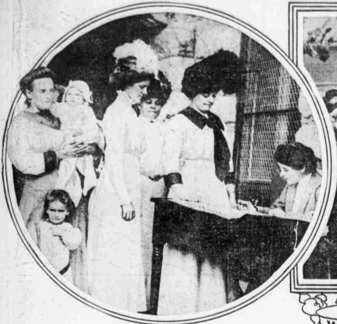
WILL THIS BE A TYPICAL PHILADELPHIA SCENE? This is how they do things in Los Angeles, Cal. It is registration day, and a woman registration clerk is taking statistics about the women voters, some of whom come with their children.