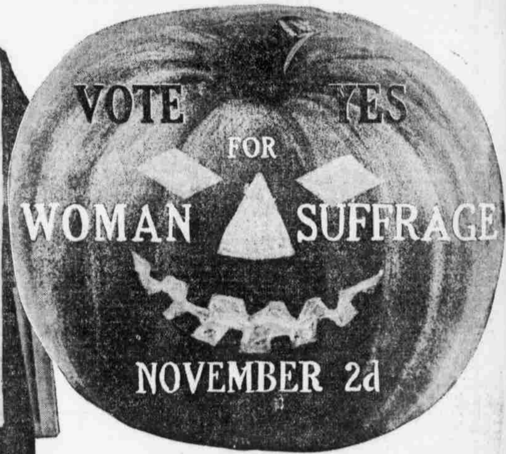
THE BOGY-MAN WILL GET YOU IF— The suffragists won't give the men even their nights in peace. This object of torture, a Halloween souvenir, it is hoped will terrify the timid into voting for woman suffrage.

DENNA'S LAST CHANCE NOV. 2nd TO BE ONE OF THE 13 ORIGINAL SUFFRAGE STATES ARE YOU GOING TO HELP