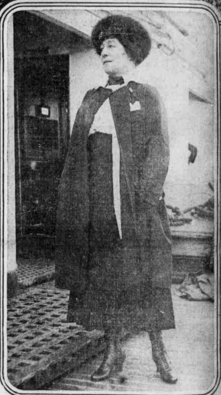
LADY DE BATHE

Lillian Langtry, the famous "Jersey Lilly," has just arrived in this country for a theatrical tour. Though persons who keep up with such things say she is 63 years old, the "Lily" appeared in one of the snappiest of short skirts.