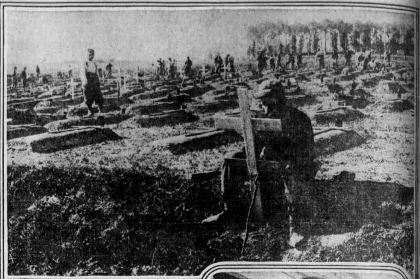
THE AUTUMN HARVEST OF DEATH REAPED BY THE FRENCH IN THEIR DRIVE AGAINST THE GERMANS OVER THE FIELDS OF CHAMPAGNE. On the left is the scene of desolation that remained after the storm had swept over the 17-mile front on which the Gallic legions concentrated their attack. A solitary cavalryman rides over a field strewn with mutilated bodies. On the right is revealed the harvest as gathered—row upon row of graves bearing empty shells, helmets and even bottles as headstones.