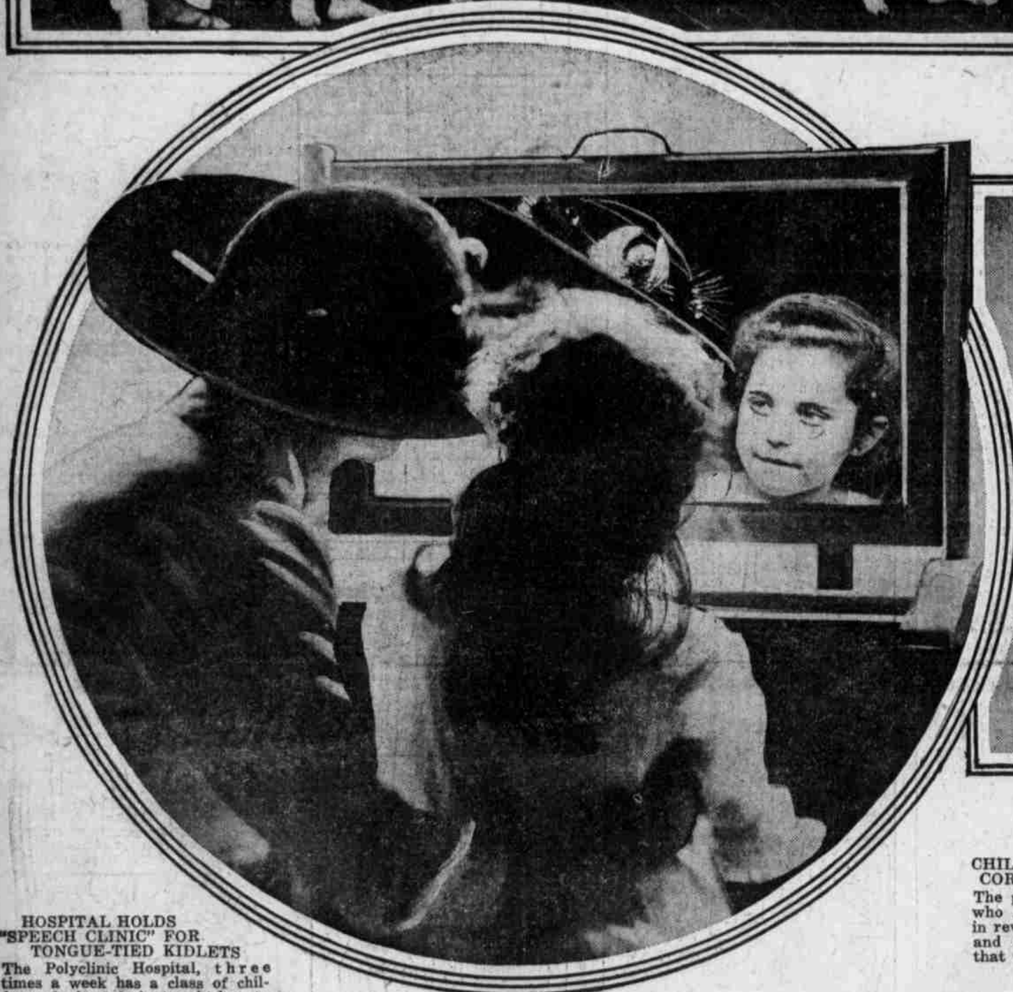
HOSPITAL HOLDS "SPEECH CLINIC" FOR TONGUE-TIED KIDLETS The Polyclinic Hospital, three times a week has a class of children who have to be taught how to talk, because of defective articulation. The picture shows a little girl being shown how to form syllables by watching her own lips.