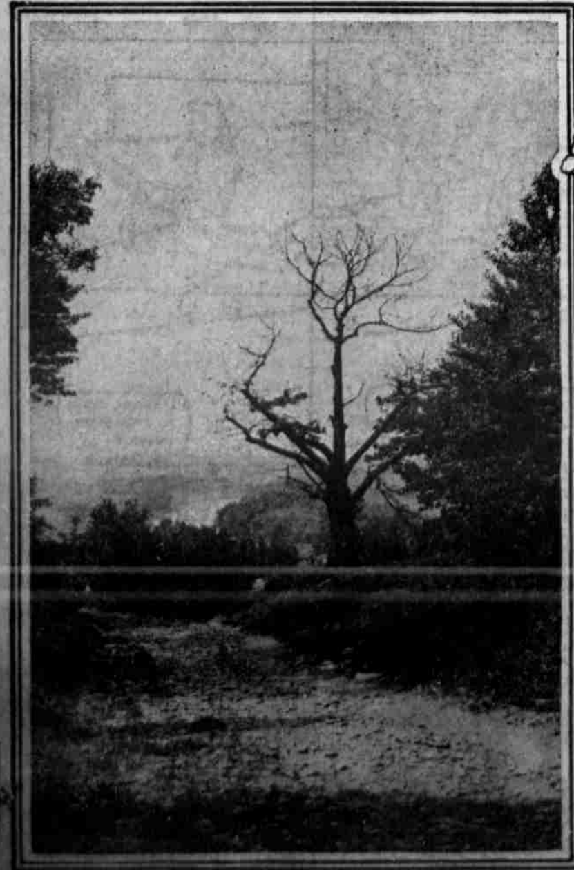
WHERE THE CHESTNUT BLIGHT HAS LAID ITS DEVASTATING HAND This once noble specimen, on the old road from Washington Lane to Washington Inn, Valley Forge, shows how the disease is marring splendid landscapes in this vicinity.