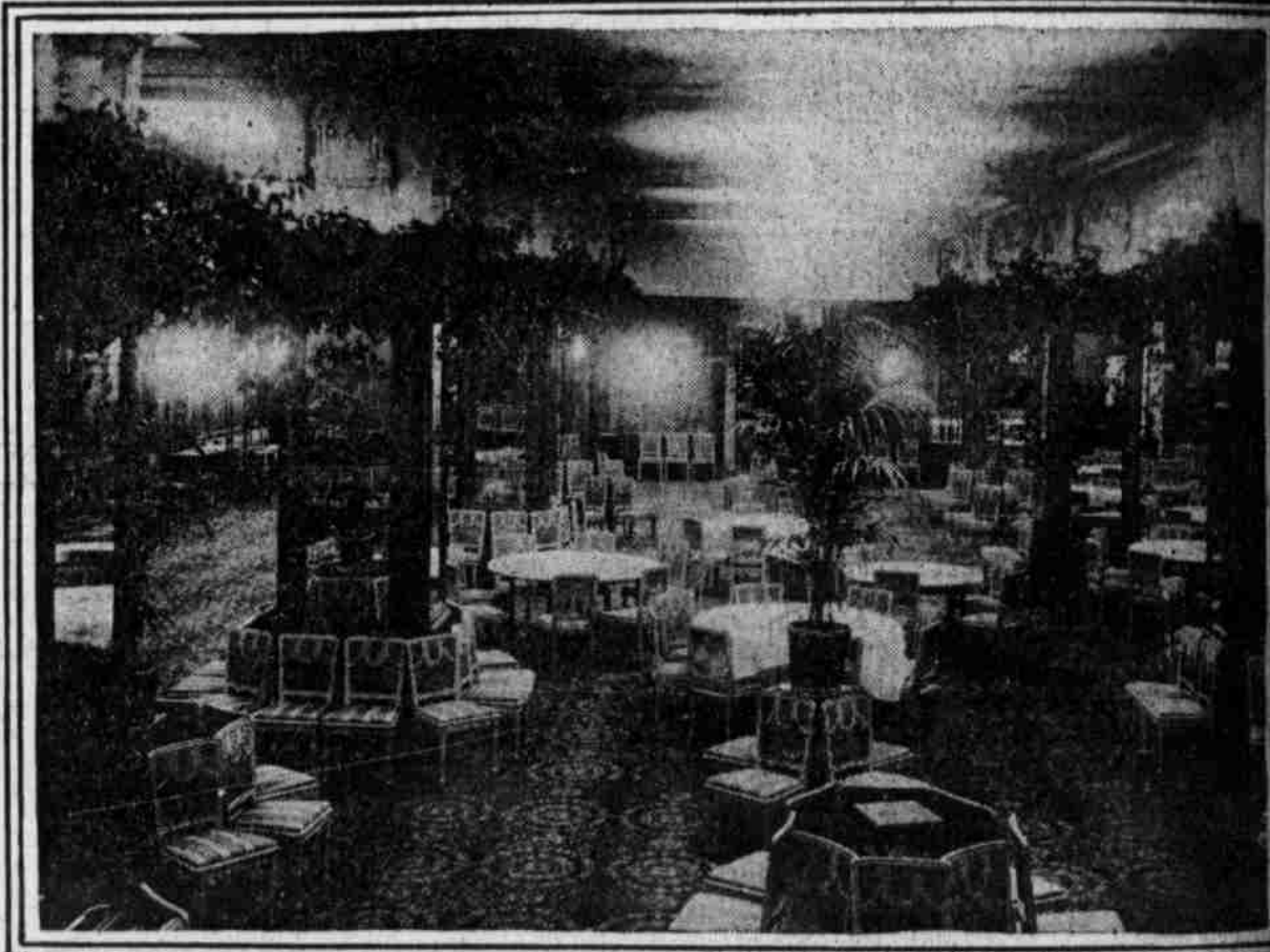
NEW OASIS FOR LOVERS OF GOOD FOOD The Arcadia, nestling under the Widener Building, opens its doors today. This is a view of the handsome main dining room, which will seat 500 persons. There will be both day and evening service.