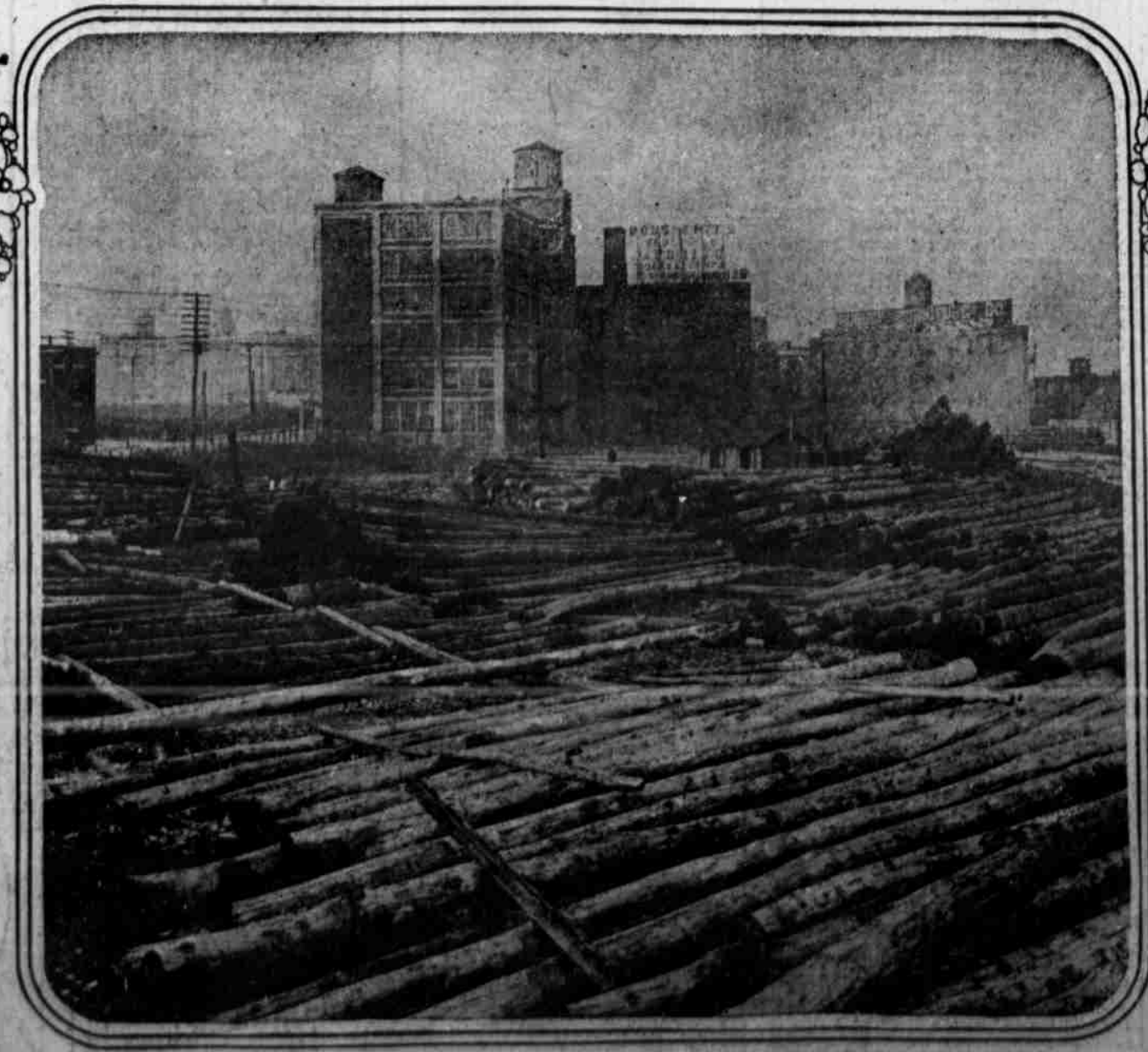
SAD END FOR ONE-TIME MONARCHS OF THE FOREST Chestnut poles gathered in the yards of an electric company in North Philadelphia. This melancholy fate awaits virtually all the chestnut trees for miles around unless the blight is checked.