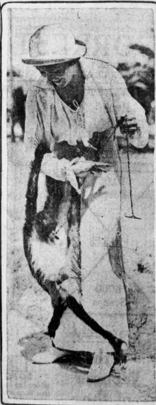
MOVIE MONKEY-SHINES Ruth Roland, Balboa actress, entertains her pet.