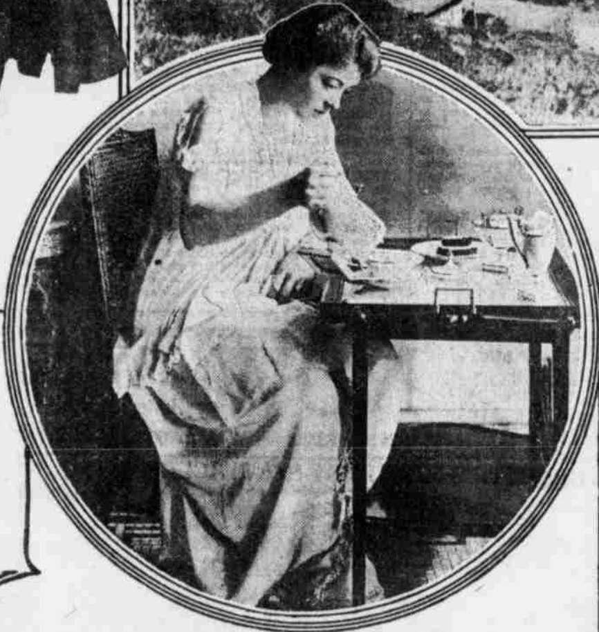
RUTH CHATTERTON TAKES TEA An intimate study of the charming star of "Daddy Long Legs."