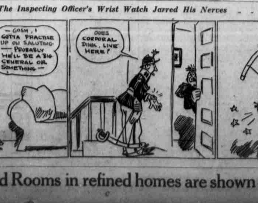
The Inspecting Officer's Wrist Watch Jarred His Nerves