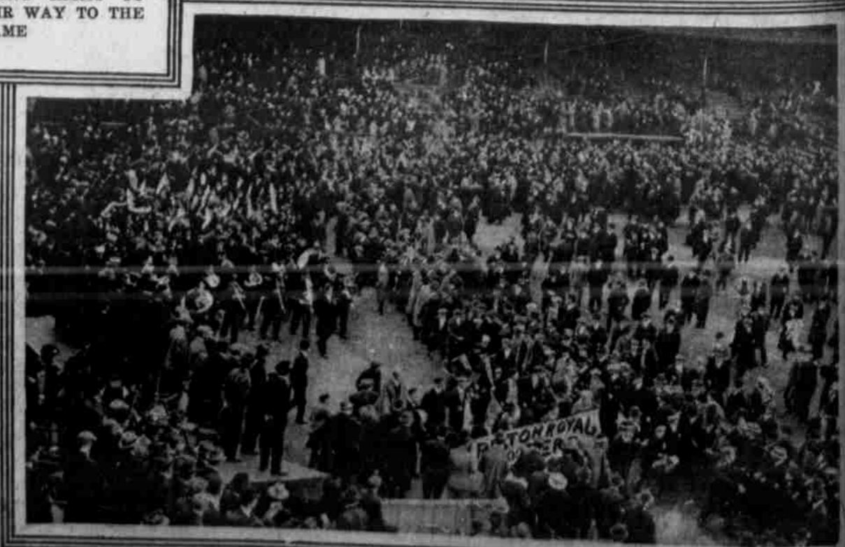
AFTER THE GAME WAS OVER—THE BOSTON ROYAL ROOTERS FORMING IN LINE FOR A TRIUMPHAL MARCH IN CELEBRATION OF THE VICTORY