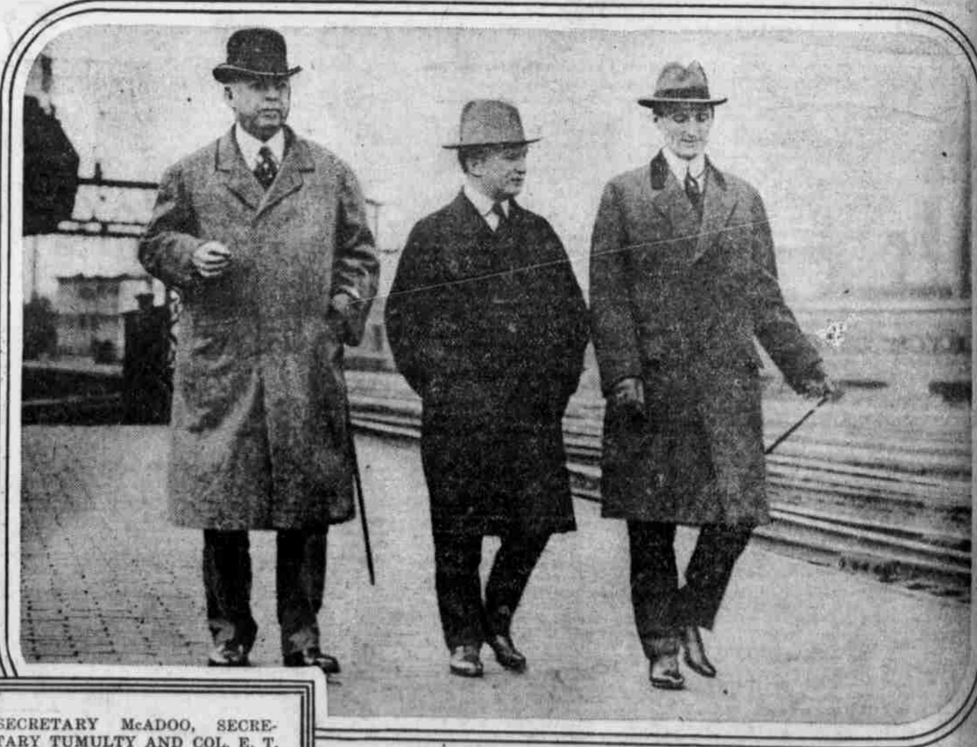
SECRETARY McADOO, SECRETARY TUMULTY AND COL. E. T. BROWN (READING RIGHT TO LEFT) ON THEIR WAY TO THE GAME