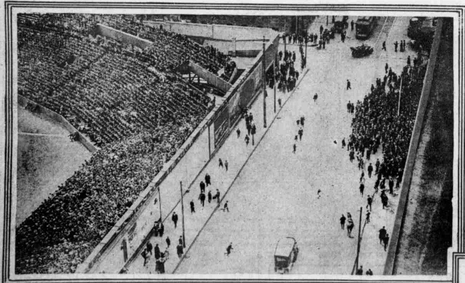
FANS WHO FAILED TO LAND A TICKET CLUSTERED WISTFULLY IN THE STREETS OUTSIDE AND ENJOYED THE GAME BY PROXY.