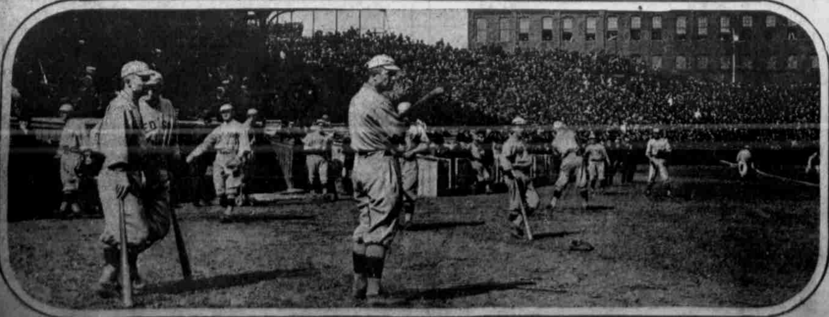
THE RED SOX TOSsing THE BALL ABOUT IN PRACTICE BEFORE THE BELL SOUNDED—A PICTURE THAT REVEALS THEM AS HEALTHY SPECIMENS OF MANHOOD