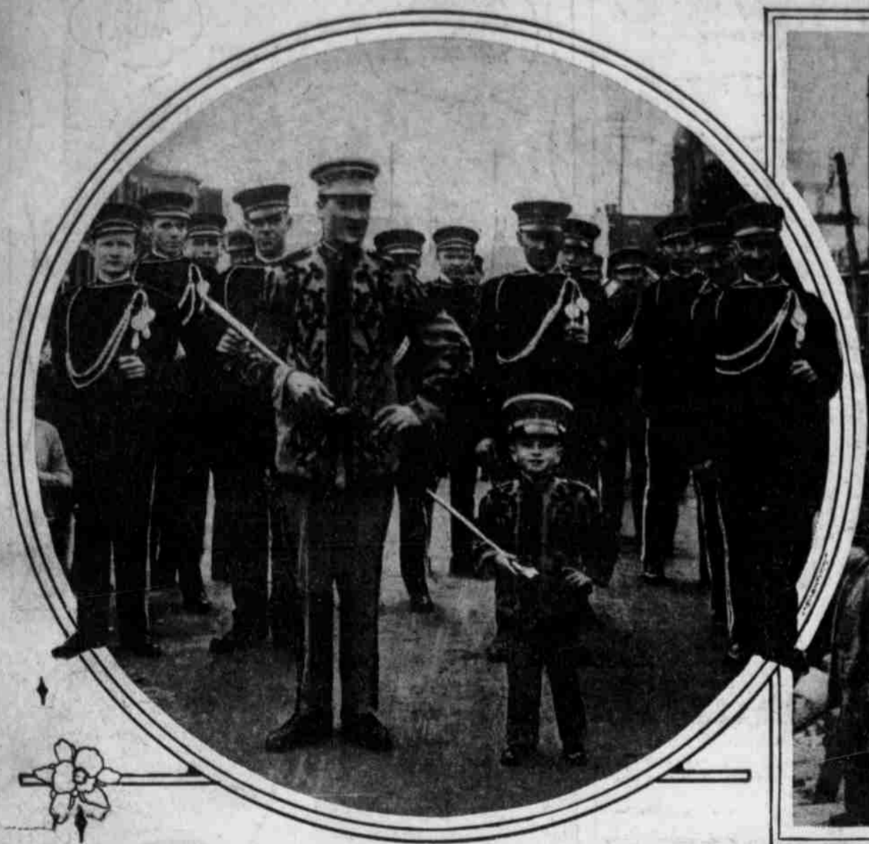
HE'S PROBABLY THE YOUNGEST DRUM MAJOR IN THE WORLD

THE WORLD AND ITS PEOPLE IN REVIEW AS THEY PASS BEFORE THE EVER-PRESENT CAMERA MAN