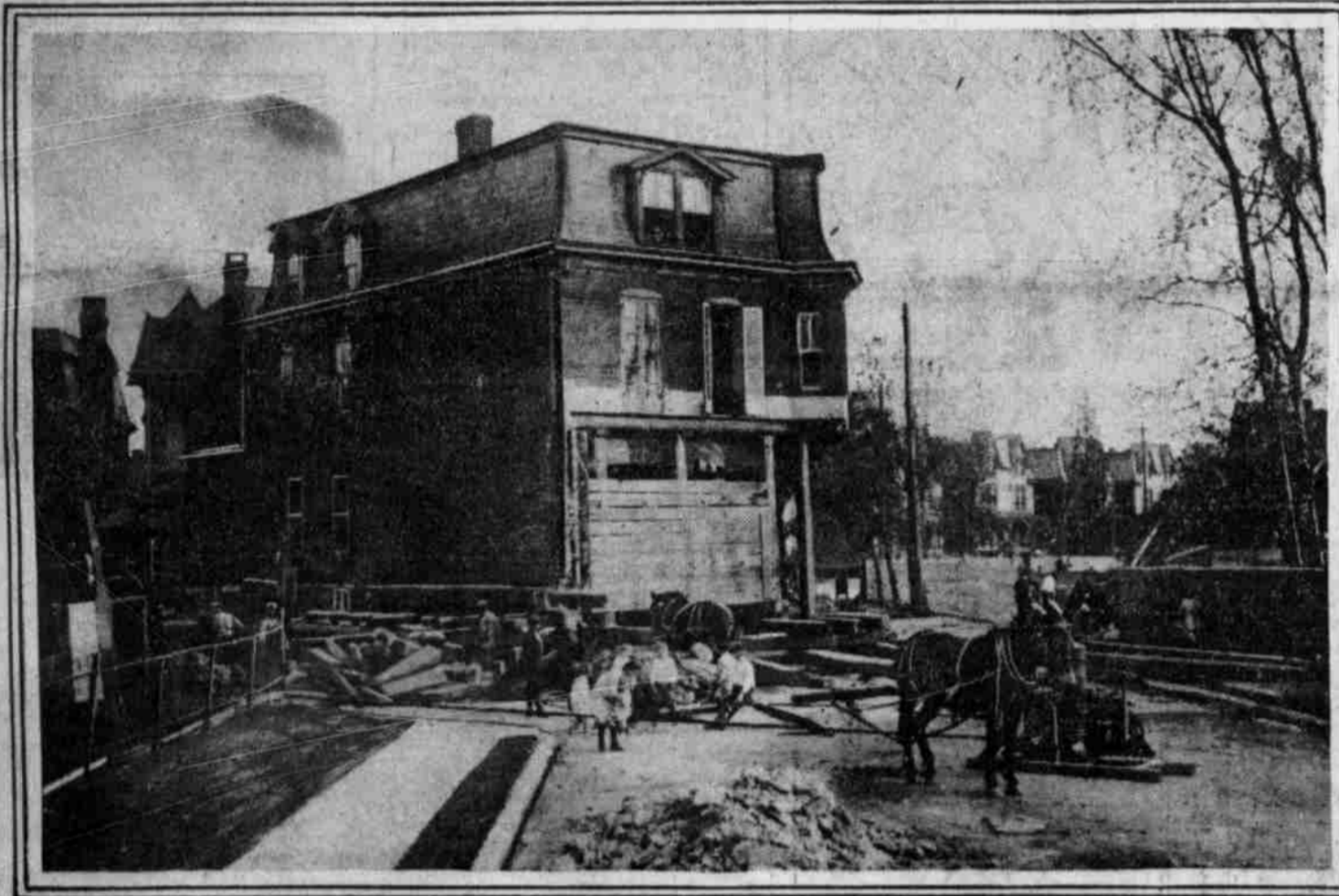
LARGE BRICK HOUSE BEING MOVED INTACT ACROSS A STREET

5000 workmen, virtually all of them busy on the manufacture of munitions, are shown here issuing from one of the gates of the Bethlehem Steel Company's plant. Most of the men are of foreign birth, a noticeably large percentage of them being Greeks. On their efforts the success of the allied armies in Europe in a large part depends.