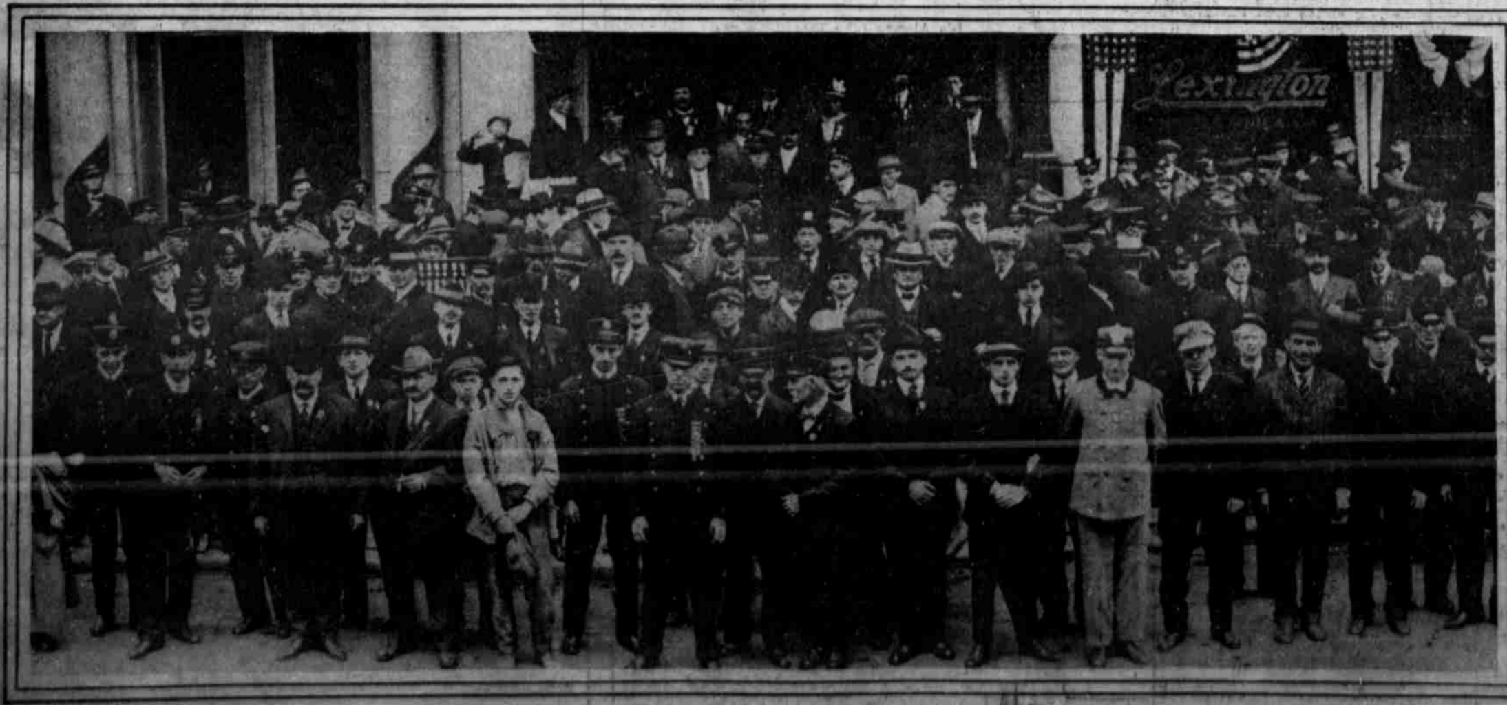
DELEGATES TO THE STATE FIREMEN'S CONVENTION BEFORE THEIR HEADQUARTERS AT SCOTTISH RITE HALL

A United States boat of the G type is nesting close alongside its "mother," the monitor Ozark.