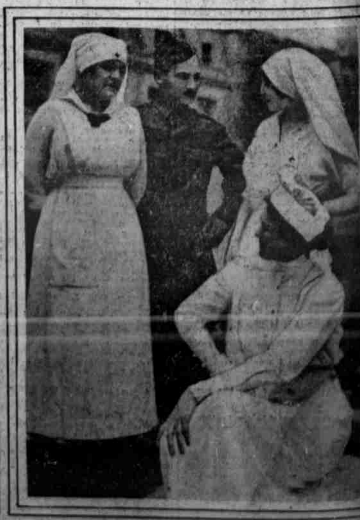
GORKY'S SON WOUNDED AT FRONT

Most of the visitors, as seen from the picture, are young men, representing virtually every prosperous town in the State. They have been holding exciting sessions all week over the election of the new president, Judge Bonniwell winning yesterday.