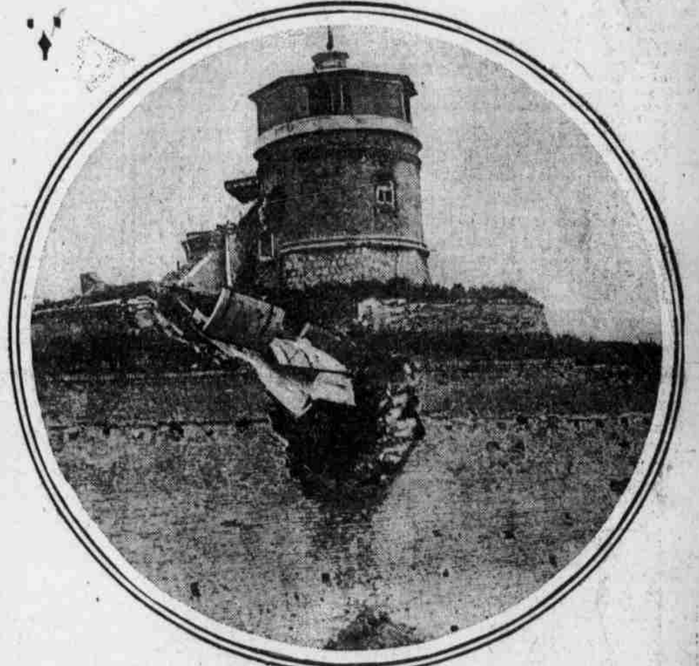
STRUCK BY A SINGLE AUSTRIAN SHELL This is a watch tower forming part of the outer defenses of Belgrade, the Servian capital, badly gashed by one of the 30-centimeter missiles which have well-nigh ruined the city.