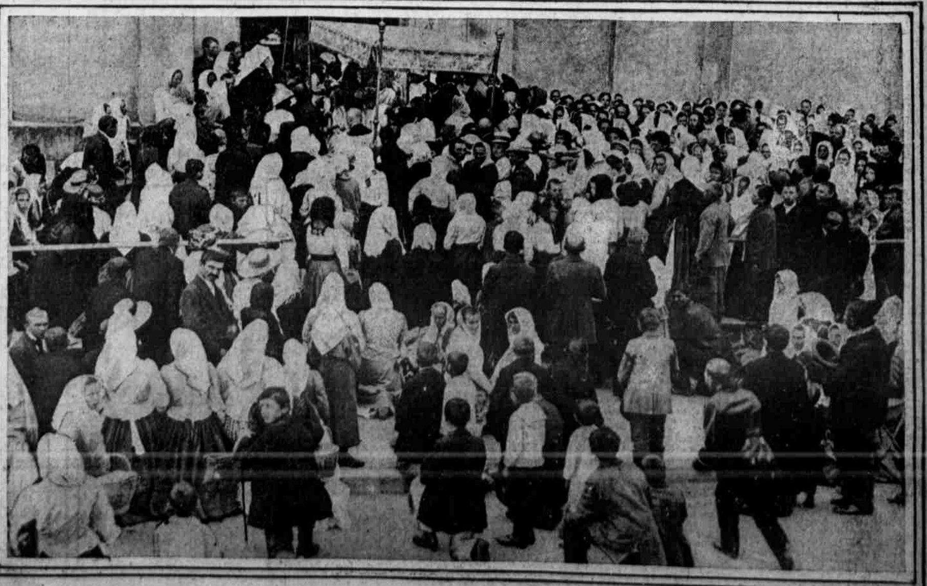
WOMEN OF GALICIA GIVE THANKS FOR DELIVERANCE FROM THE DREADED COSSACK Since the great Austro-German effort drove the invading Russian back across his own borders, except for a narrow strip, services in the churches of Galicia have been almost continuous. Wives and mothers are shown kneeling before the altar, where some of them remain for hours at a time in prayers of thanksgiving.

Discussed by International News Service. DISCUSSING A NEW TYPE OF SUBMARINE FOR THE U. S. NAVY ... do so ... ... with Daniels and Henry Ford having a walk and talk in the course of the latter's ... ... Washington, when he was taken down in a ... ... much pleasure ... ... proposed gasoline motor would ... ... "The J. D." replies