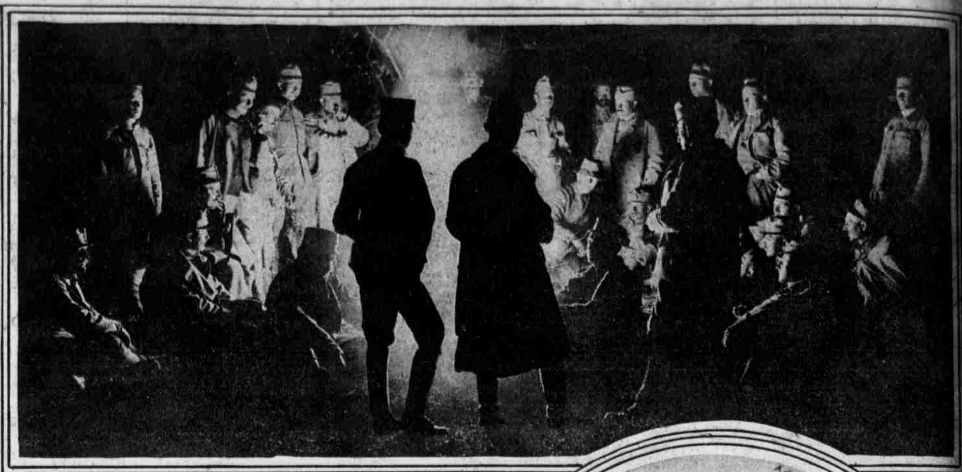
THE CAMPFIRE IS CHEERFUL AFTER A DAY OF HARD FIGHTING Officers of the Austrian army, which finally turned and drove the Russians back over their own border, are relaxing and swapping yarns with an American correspondent, whose slouch hat is seen to the right of the blaze.