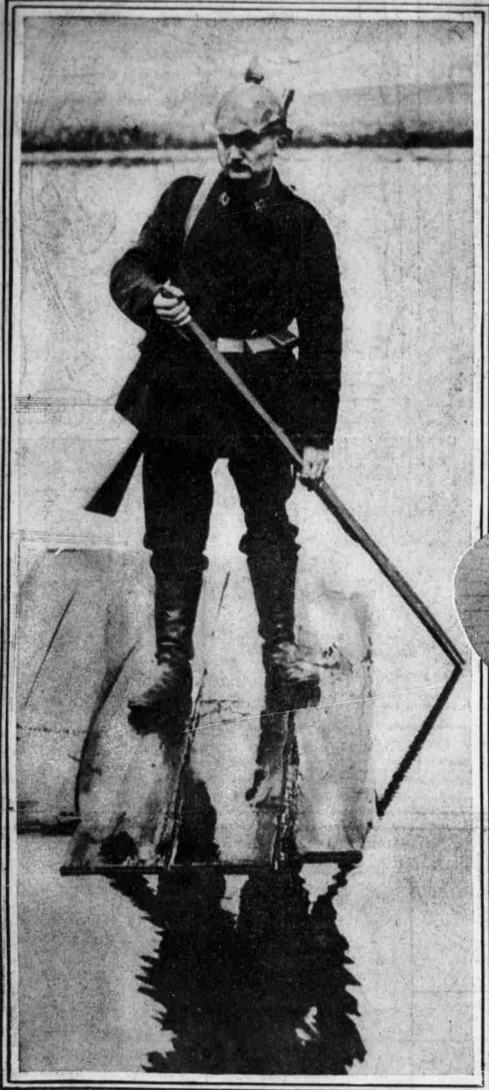
NAVIGATING A BATTLEFIELD This German soldier constructed this little raft for himself in doing scout duty over ground submerged by the cutting of the Flanders dykes.

PERSONS, SCENES AND EVENTS THAT FIGURE IN THE NEWS OF THE DAY FROM DIVERS SOURCES