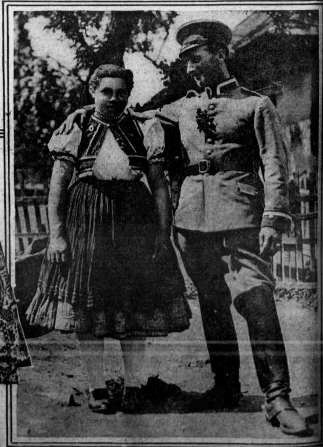
PERHAPS HE IS CALLING HER HIS GIBSON GIRL