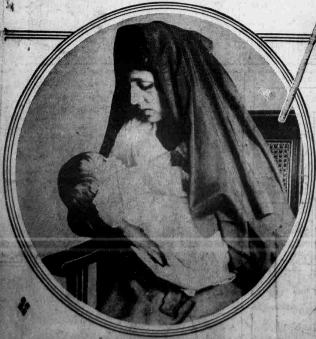
SLAYER OF FAITHLESS LOVER