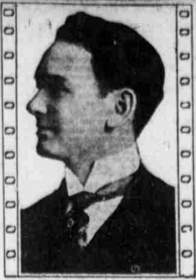
DONALD BRIAN The noted singer and dancer has taken the movie plunge...