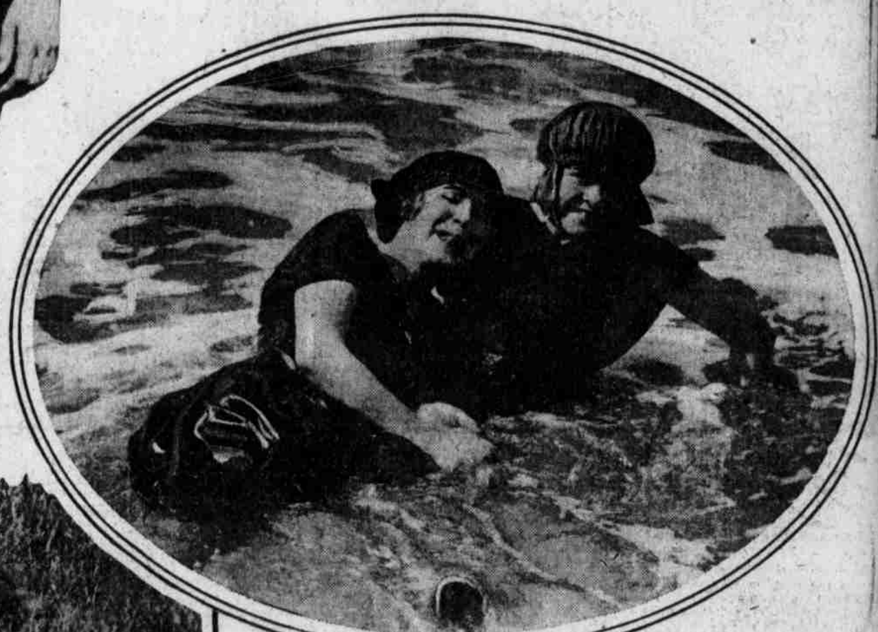
SURF POPULAR, THOUGH FALL IS HERE One of the ladies here exhibited her opinion of the intruding photographer in this unmistakable fashion.