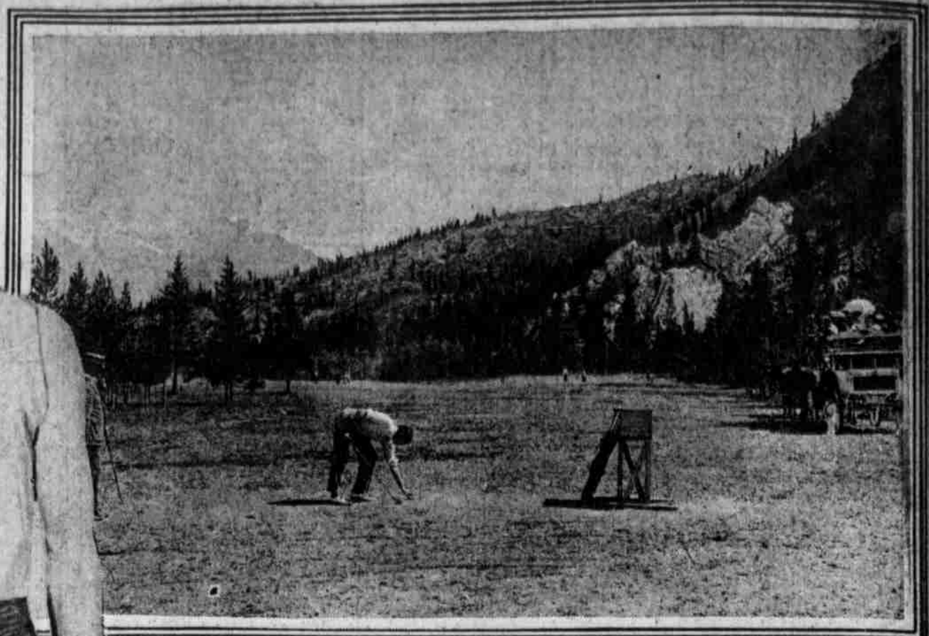
GOLF LINKS 5000 FEET ABOVE SEA LEVEL INSURE COOLNESS These natural links are situated on a plateau surrounded by the towering, ice-clad peaks of the Canadian Rockies, also at Banff, Canada.