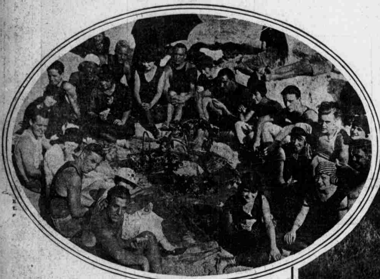
LAST CALL FOR BEACH PARTIES ON SAND The warm weather has imparted longer life to the summer season at the shore, where this is a favored form of amusement.