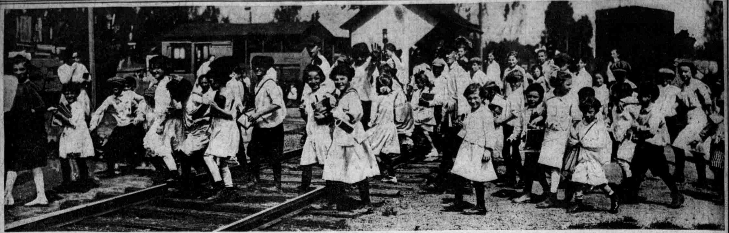
WHERE 1000 OF ELMWOOD'S CHILDREN DAILY ENDANGER THEIR LIVES ON RAILROAD CROSSING AT EASTWICK AVENUE AND 85TH STREET, WHICH IS LEFT UNGUARDED, DESPITE SEVERAL FATAL ACCIDENTS SINCE JANUARY 1.

MARCH OF EVENTS, BOTH AT HOME AND ABROAD, PICTURED BY THE EVER-PRESENT CAMERA MAN