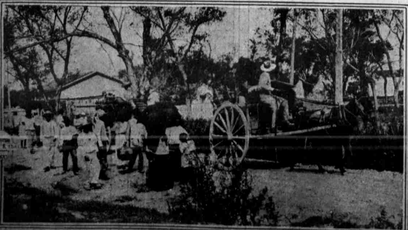
PEOPLE OF MEXICAN BORDER SEE THE MELANCHOLY SIDE OF WAR Both American and Mexican families living near the boundary line have found themselves in the plight of the Belgian refugees, in consequence of the guerrilla fighting between soldiers and rangers on one side and alleged bandits on the other.