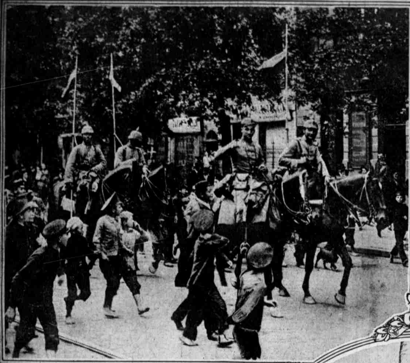
GERMAN ENTRY INTO WARSAW WAS LIKE A CIRCUS That a boy is a boy the world over is evidenced by this photograph. To the Polish lad the triumphal Teutonic procession, with its glittering uniforms, fluttering pennons and martial music was a supreme spectacle worth the cost to his country.

WHERE THE NEWS IS, NO MATTER WHAT THE PLACE, TIME OR COUNTRY, THERE IS THE CAMERA MAN