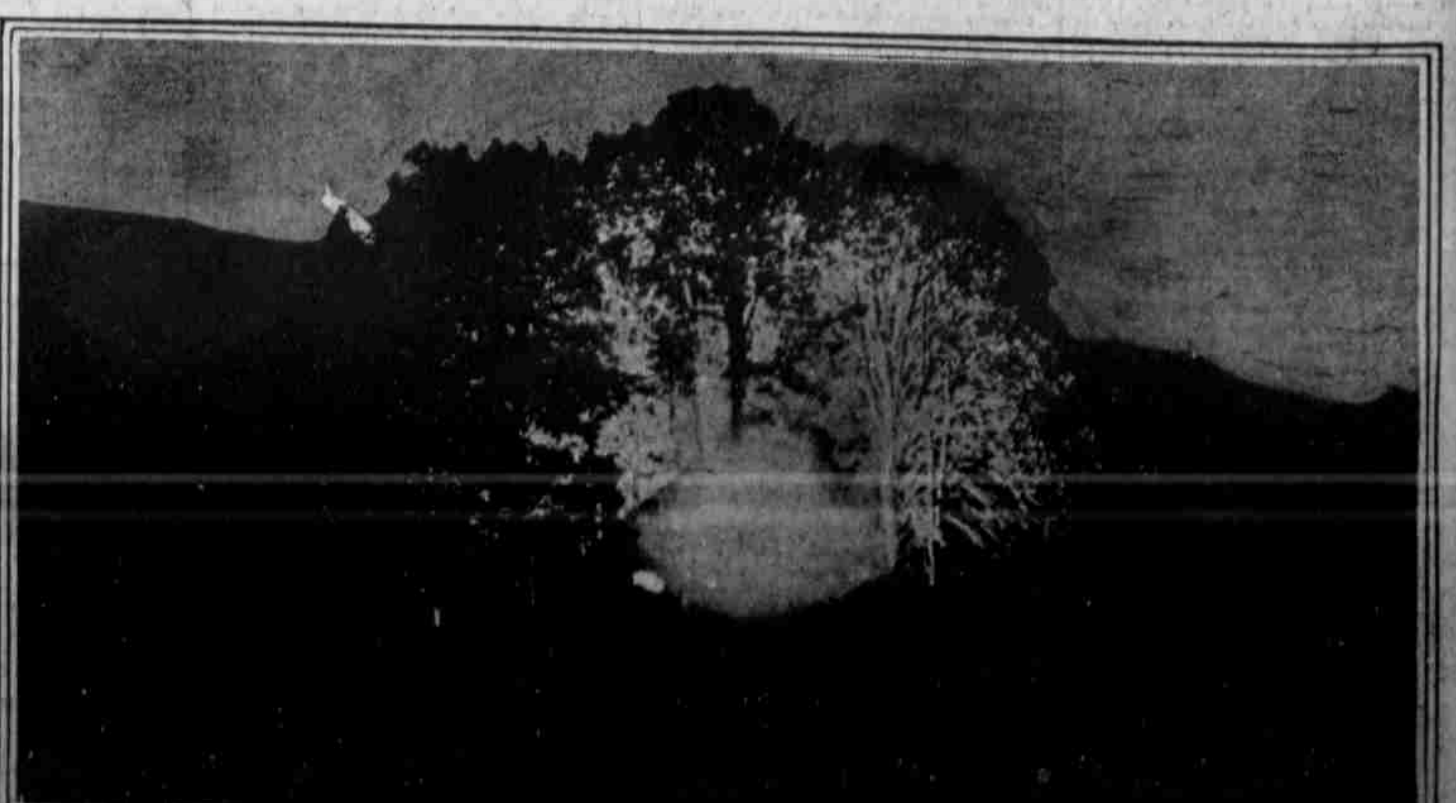
SEARCHLIGHT BOMB LIGHTS UP RUSSIAN FARMHOUSE The Germans employ these bombs constantly at night to reveal the enemy's position and to guard against surprise attacks. They burn brilliantly, some for a full minute. This picture, taken not far from the Polish boundary, gives an idea of this long-range illumination.