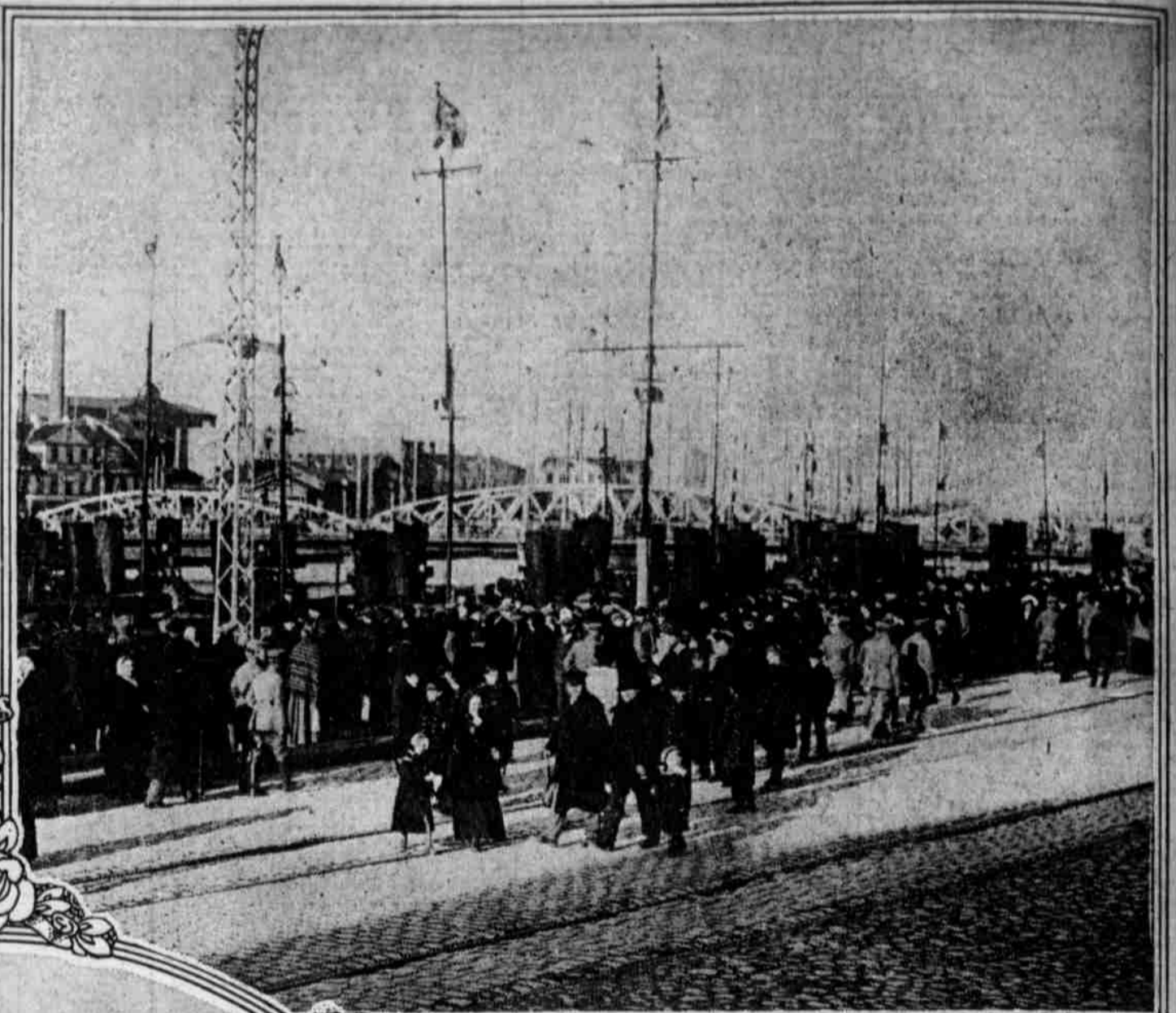
CROWDS SEE GERMAN TORPEDOBOATS AT LIBAU Following their capture of this port, the Germans promptly made it a base for a possible attack on the Russian ships.