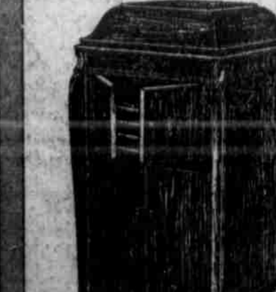
VICTROLA XIV MAHOGANY OR OAK