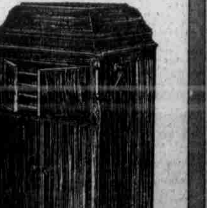
VICTROLA XVI MAHOGANY OR OAK