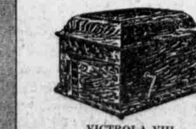
VICTROLA VIII OAK