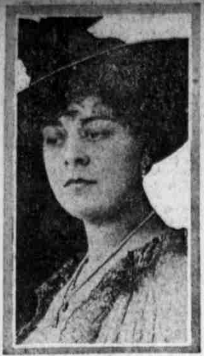
BETTY NANSEN Appearing next week in "The Song of Hate," a modern Tosca.

LA STRADA DI BOLZANO È DANNEGGIATA DALLE ARTIGLIERIE ITALIANE