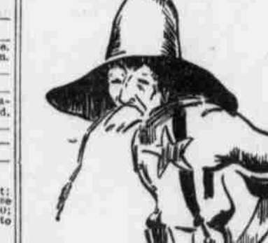
I'm gonna stay in these woods for two weeks, you come back for a week from next Friday.