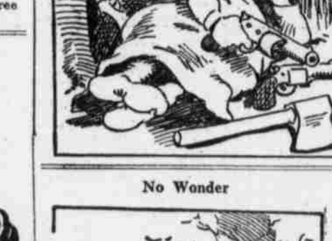
I'm gonna stay in these woods for two weeks, you come back for a week from next Friday.