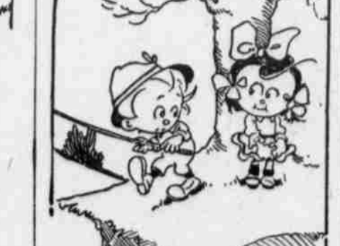
Gosh, it's so quiet in here, it gives me the creeps, wonder what the fellas back home are doing tonight.