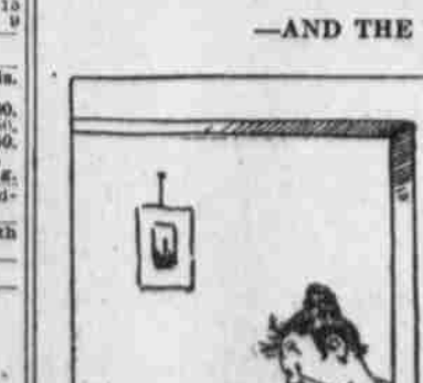
If you stayed there another night, you'd be a wreck.