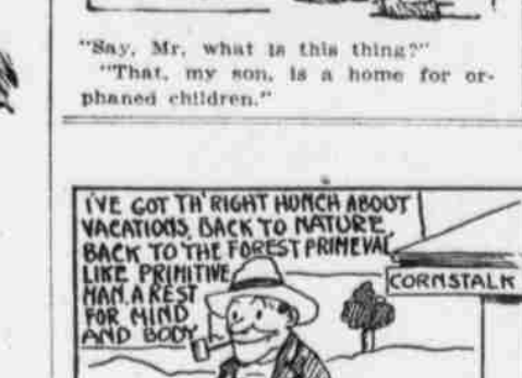
"Say, Mr. what is this thing?" "That, my son, is a home for orphaned children."