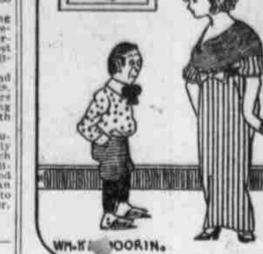
The Mean Thing

THE MEAN THING Sammy (A brilliant youth)-Say, ma, don't make your hands warm when you smack me? His mother-Why, yes, Sammy, it does. Sammy-Then wouldn't it do just as well if you held them over the gas stove?