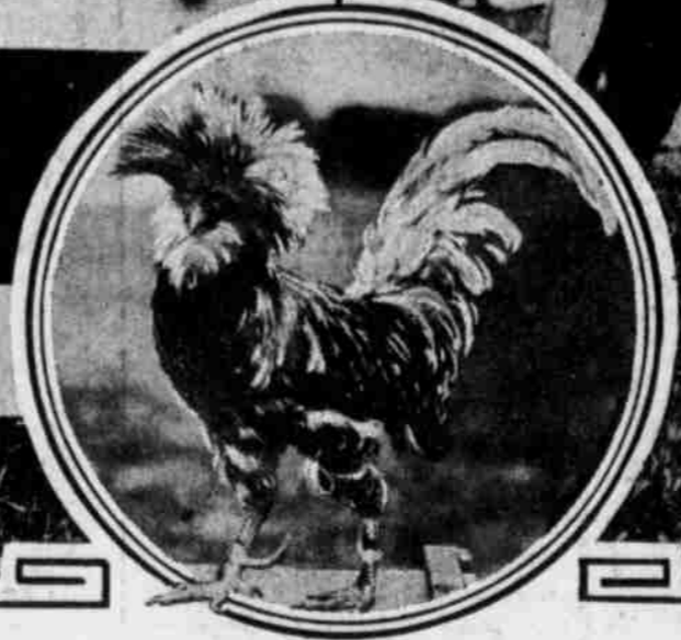
BEARDED FACED POLISH ROOSTER, BLUE RIBBON WINNER