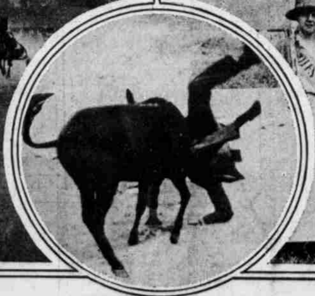
HE FAILED TO WIN THE $2500 FOR STAYING ON THE DONKEY