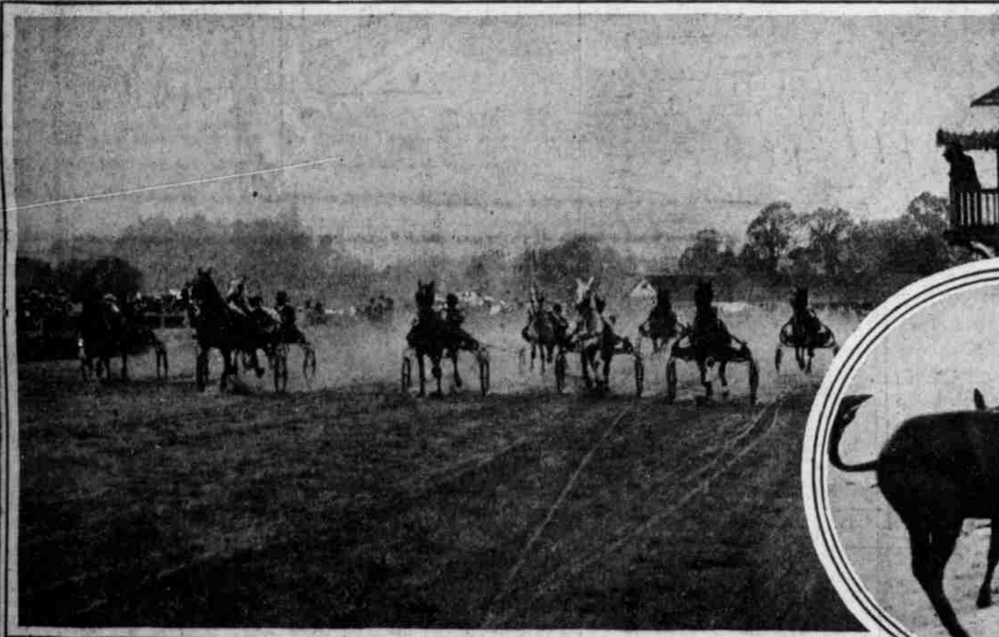
THE TROTTING RACES FILL THE GRANDSTANDS EVERY DAY