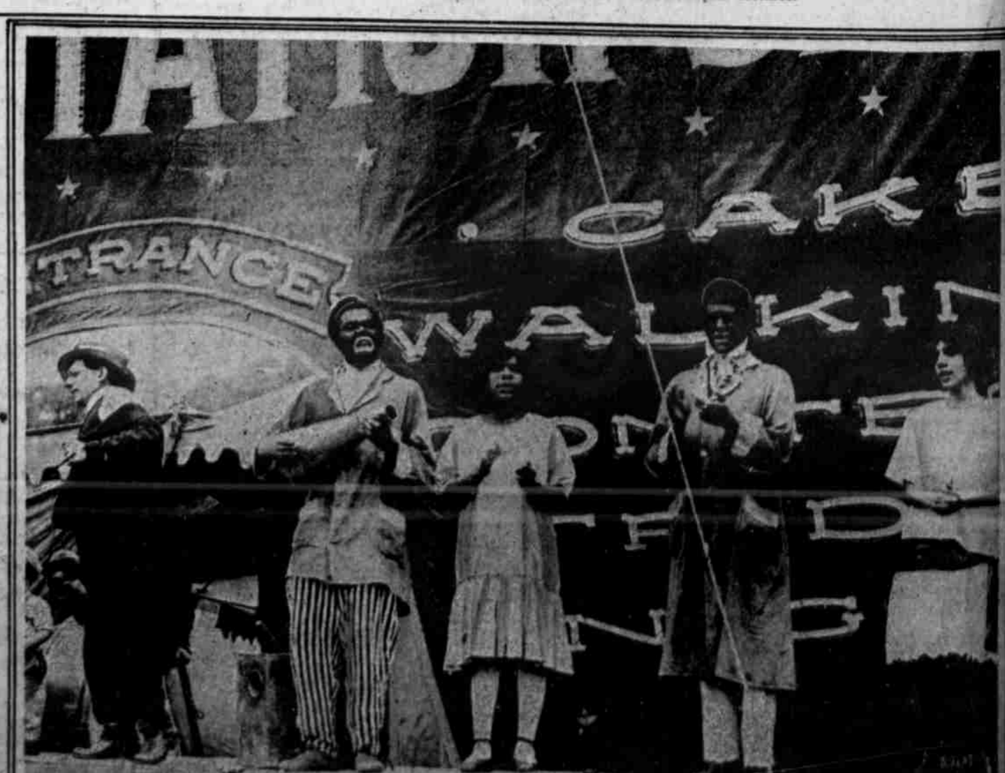
THE PLANTATION SHOW LURES HUNDREDS OF VISITORS