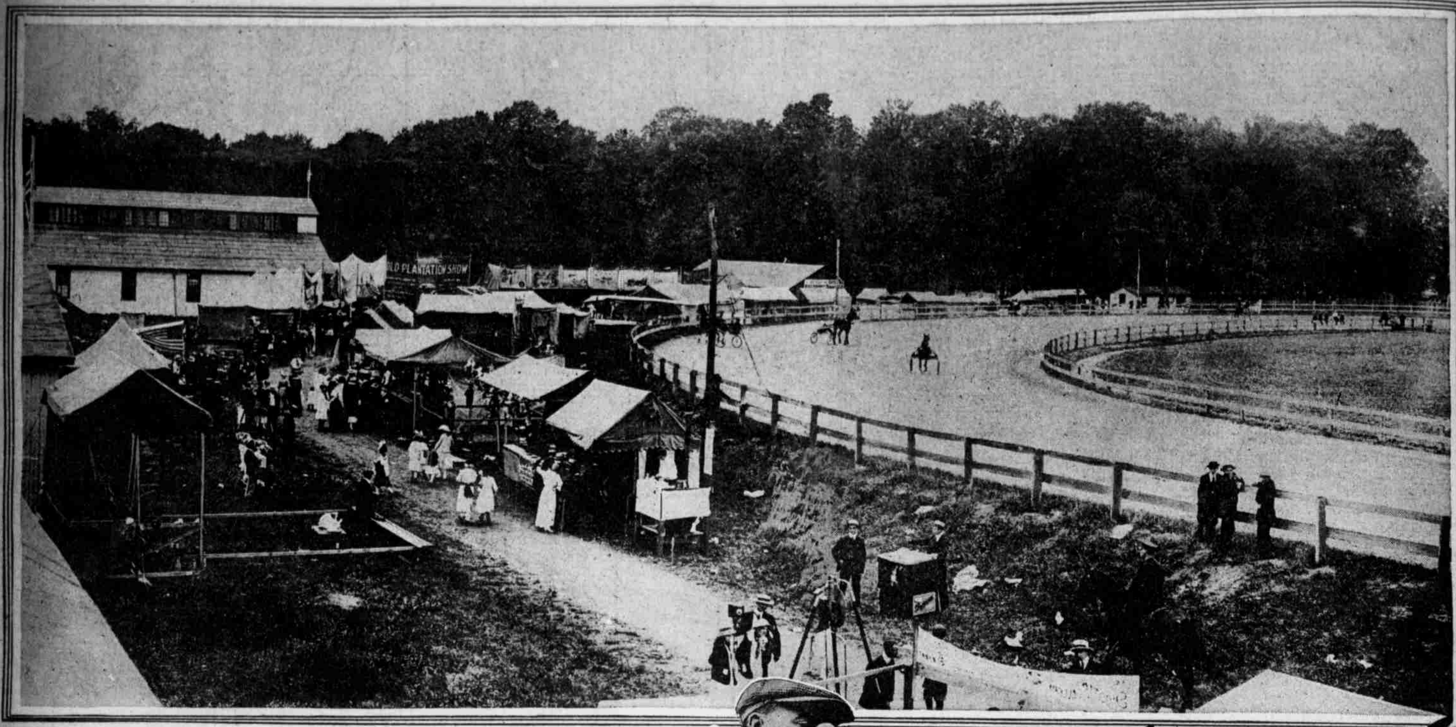
PANORAMA VIEW OF SECTION OF BYBERRY FAIR Philadelphia's Annual County Fair opened yesterday. Part of the racetrack, with horses in sulkys exercising; the "Midway" and booths are seen.

SEPTEMBER BRINGS THE OYSTER AGAIN; LIKEWISE COUNTY FAIRS AND LUSCIOUS, JUICY APPLES