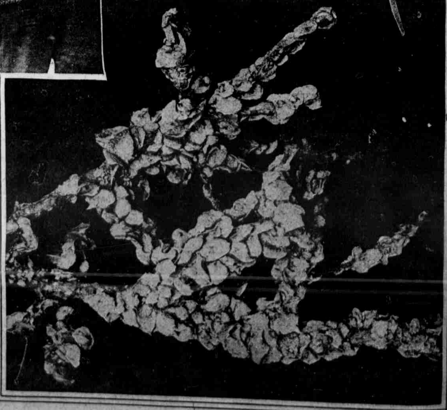
FANTASTIC SHAPE TAKEN BY CLUSTER OF OYSTERS These molluscs fasten themselves to any object that presents itself. The cluster in the picture is attached to a twig.