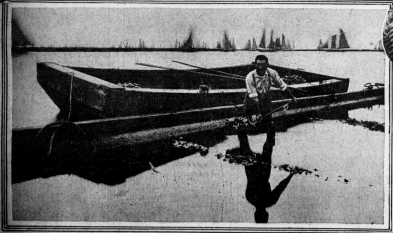
OYSTER SEASON IS ON ONCE MORE AT BIVALVE, N. J. The oysters in the foreground have been laid by for two tides, to fatten for the market at Maurice River.