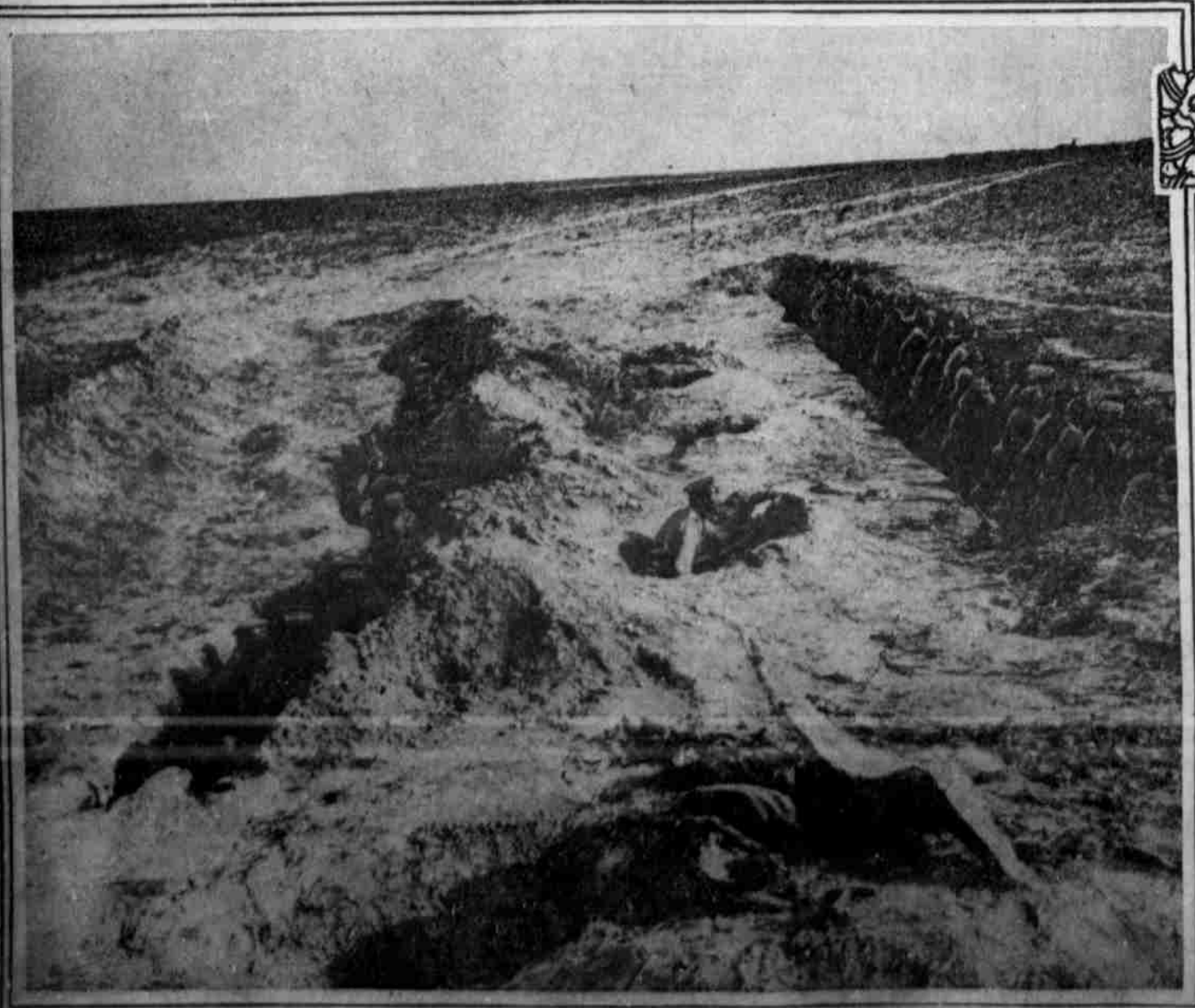
CZAR'S CRACK REGIMENT AWAITING THE EVER-ADVANCING GERMANS here are sorn of the famous Fonogorijski Regiment, which was the war began a year ago, has taken part in 31 battles, they have just dug themselves in to cover the retreat of their contrades, who are fleeing to escape being caught in the German visc.